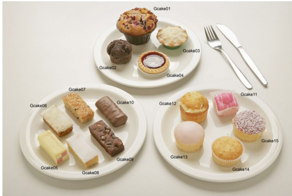
Fig. 2. (colour online) Example of guide photograph showing range of portion sizes available.