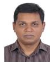
(+ Corresponding author)