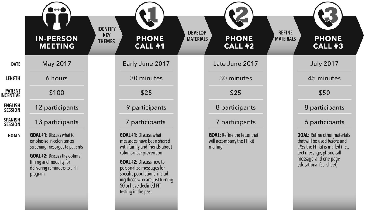
Figure 1. Boot camp translation overview. FIT, fecal immunochemical test.

room to identify and discuss trends with the larger group.