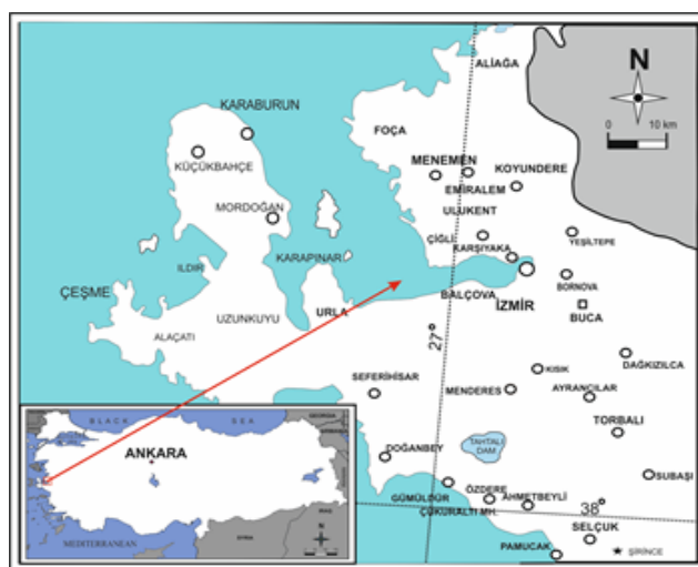
Fig. 1 Location map of the study area: The Gulf of İzmir

The samples investigated within the scope of this study were collected from four different sampling locations in the Gulf of İzmir (Fig. 1). The Gulf of İzmir is located at the west of Turkey in the Aegean Sea ( 38^{\circ} 41' to 38^{\circ} 21' N, 26^{\circ} 30' to 27^{\circ} 08' E), and it is a natural gulf roughly forming an “L” shape [10]. The total surface area of the gulf is 500 \text{ km}^2 , its water capacity is 11.5 billion \text{m}^3 and its total length is 64 km [8]. The gulf is divided into three different regions based on the physical properties of the water bodies: the Inner Region, the Middle Region and the Outer Region [8]-[10]. Water depth in the Outer Gulf is approximately 70 m, and the depth decreases to 15 m towards the Inner Gulf [11]. The Inner Gulf is a center for intense industrial and commercial activities (especially iron, pulp and paper factories, toxic paints, chlorine-alkali facilities, cement plants, wood processing and bottling plants and intense harbor activities) [1]-[12]. The main pollutant factors in the gulf are streams of varying capacities, and over one hundred canals flow into the gulf.