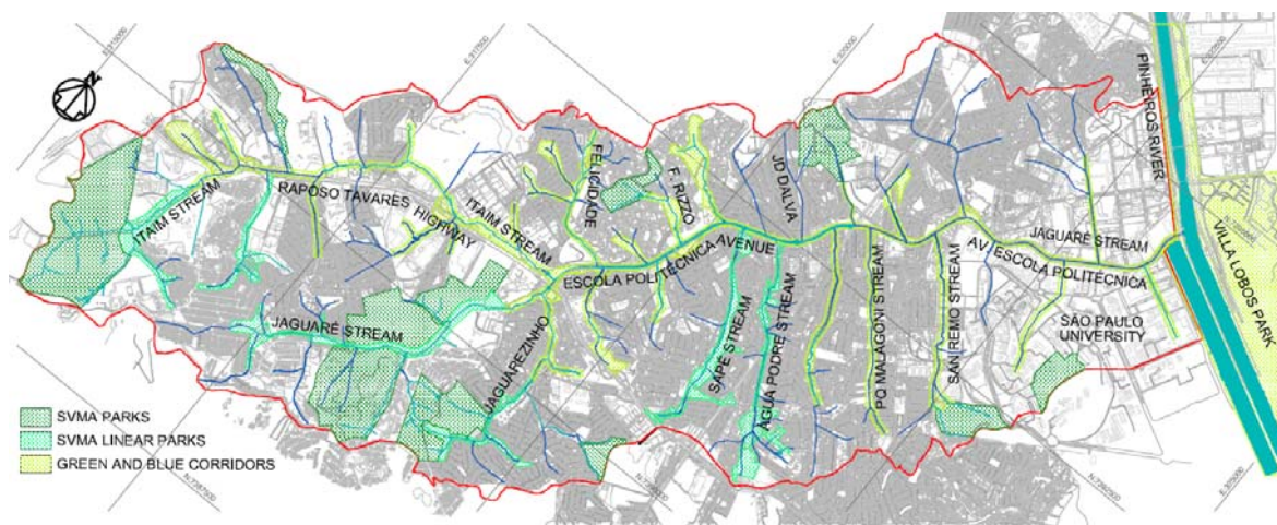
Fig. 4 Blue and green infrastructure proposal.