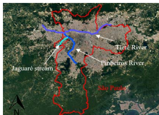
Fig. 1 Jaguaré watershed in São Paulo city.

industrial uses too, due to the proximity to the Raposo Tavares Highway, which is an important connection between the city, the countryside and the southern coast of the state, as well as the south of the country.