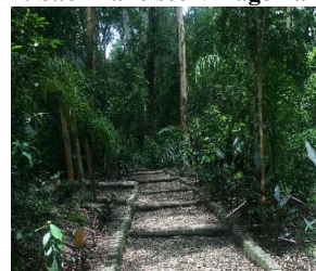
Fig. 2 Types of forest fragments in the Jaguaré watershed.

Fig. 2 shows different examples of green areas in the Jaguaré watershed, such as Evandro Valério Square, which has recreational equipment improvised by the population; the site of the Escola Politécnica Avenue at its intersection with the Raposo Tavares Highway, which was recently planted by the Green and Environmental Secretariat of the São Paulo