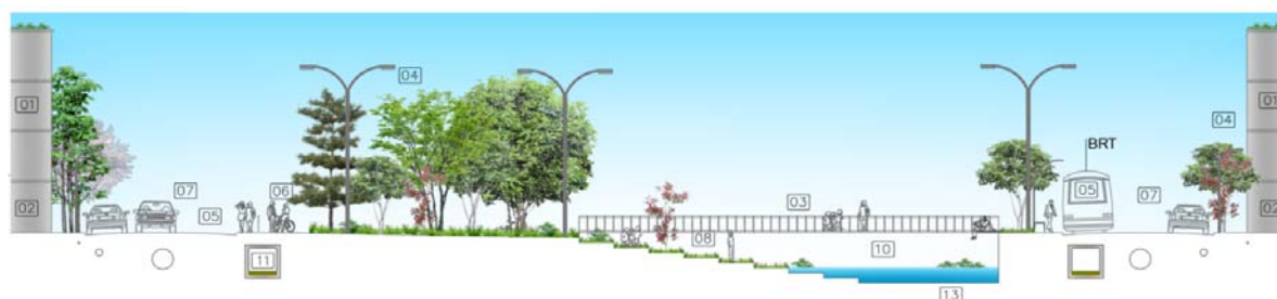
Fig. 5 Typical cut for the proposed blue and green corridors. (1) Multiple use buildings with green roof; (2) Living Ground Floor with commercial units; (3) Crossing bridge for pedestrians; (4) Planting of suitable species; (5) Public transportation; (6) Bike trail; (7) Limitation of the use of individual transport; (8) Roof terrace; (9) Sustainable drainage; (10) Use of phytoremediation species in the watercourse; (11) Sustainable drainage; (12) Health infrastructure; (13) Regularization of the canal bed with sustainable techniques; (14) Adequate lighting to promote nighttime use of structures

Fig. 5 shows a typical cut that could be applied to a blue and green corridor with leisure areas, transportation infrastructure, vegetation requalification, sanitary infrastructure to control water quality, elements of connection between population and area, control of use and occupation to promote the circulation of the population in the area.