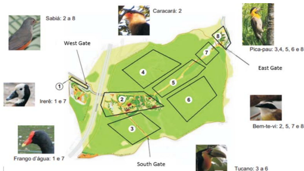
Fig. 7 Birding sites at Tizo Park [8]

swamp chicken (Gallinula chloropus) [8]. Fig. 7 shows the bird sighting points in Tizo Park, according to a survey conducted by SVMA [8]. In the Villa Lobos park, according to [7], 51 species of birds were found, as presented in Table I.