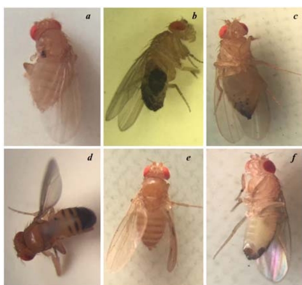
Fig. 2 Morphoses detected in first generation Drosophila melanogaster of the EP-2 test-system: a) morphoses combination - extreme mutant wing phenotype (without a wing), deformation of the head, thorax and abdomen; b) black plaques on a body (melanoma); c) group of small spots (melanomas); d) melanoma and abnormal tergite pattern; e) moderate mutant wing phenotype (improperly outspread wing); f) melanoma

Analysis of the imago with morphoses showed that they have practically no effect on the flies' life activity: they do not interfere with their existence, mating, and even giving birth. In the descendants of the irradiated ones in the next generations ( F_2 and F_3 ), various deformities can often be observed, and all that morphoses astonish with their diversity and depth of disorders that do not affect the viability and breeding of the flies. Under the usual conditions for the cultivation of fruit flies in the absence of stress factors, experimenters may also encounter morphoses, but this happens very rarely [13].