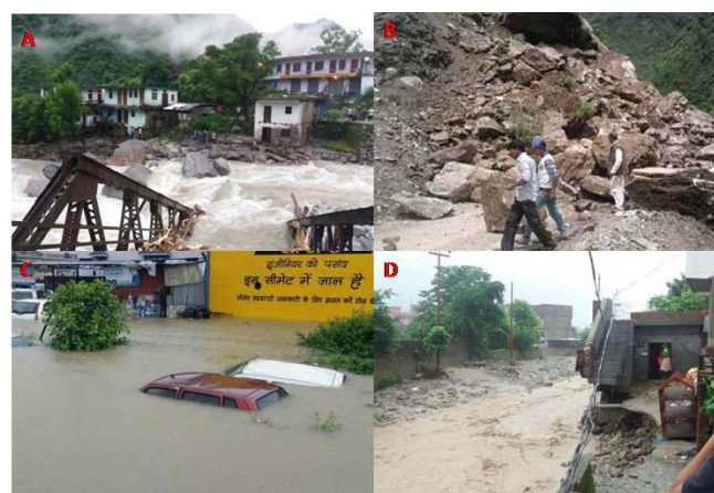
Fig. 2 A. Bridge collapsed due to flashfloods in Kanar village, Pithoragarh; B. Huge landslide on the Gangotri pilgrimage road; C. Roads are over flooded due to cloudburst-triggered floods in Dehradun city; D. Houses collapsed along the seasonal Nala in Kotdwar due to cloudburst (All these incidences occurred in the second week of August 2017)

In the second week of August 2017, cloudburst-triggered flashfloods and landslides have devastated Malpa village, Kotdwar town, and Dehradun city where a number of people died and huge property was damaged (Fig. 2).