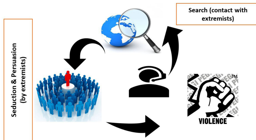
Figure 1. The process by which Individuals [Often] Come to Embrace Extremist Content Online.