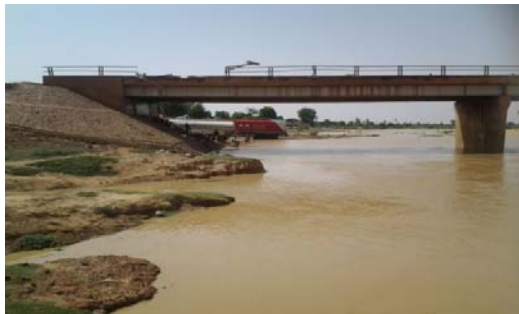
Fig. 2 Station B: At the bridge (domestic and industrial activities discharge untreated effluent into the receiving stream)