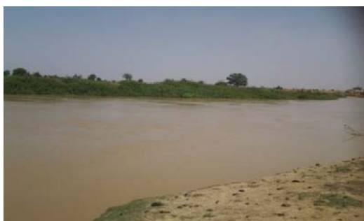
Fig. 1 Station A: Upstream, mostly consist of agricultural activities

Water samples were collected as described by [6], in two 1-liter sterile plastic containers from three designated sampling points in Jega River (fortnightly) between March and July 2014. Three locations were marked for sample collection, namely; Station A (before the bridge; upstream), Station B (at the bridge where human activities such as dyeing, car washing and laundry), and Station C (after the bridge; downstream). Figs. 1-3 show the pictorial presentation of the sampling stations.