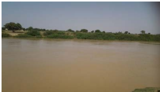
Fig. 3 Station C: Downstream (mostly preoccupied with agricultural activities and waste disposal)

The sampling bottles were pre-conditioned with 5% nitric acid and later rinsed thoroughly with distilled de-ionized