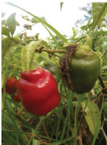
Figure 1. The intense red color in rocoto pepper fruits. Evidence of physiological maturation stage.

To guaranteed seed extraction, longitudinal cuts were made on fruits using surgical masks and latex gloves (Pacheco & Zuñiga, 2007). Seed disinfection was performed by seed washing with hypochlorite water solution at concentration of 5% v/v, followed by two washes with deionized water. Subsequently, seeds were dried at room temperature for one day.