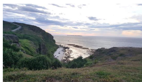
The most impressive geo-trail in Ly Son Geopark