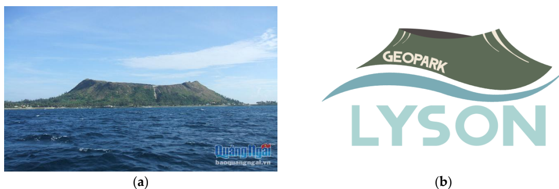
Figure 1. (a) Thoi Loi volcano on Ly Son island [8]. (b) Ly Son Geopark logo.

The proposed logo is based on the shape of Thoi Loi volcano on Re Isle. On the way to the island, the volcano looks like a ship riding the waves to the east. This very simple yet significant image is suggested for the logo of Ly Son Geopark (Figure 1).