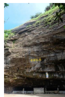
Chua Hang Cave