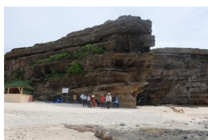
Hang Cau Cliff