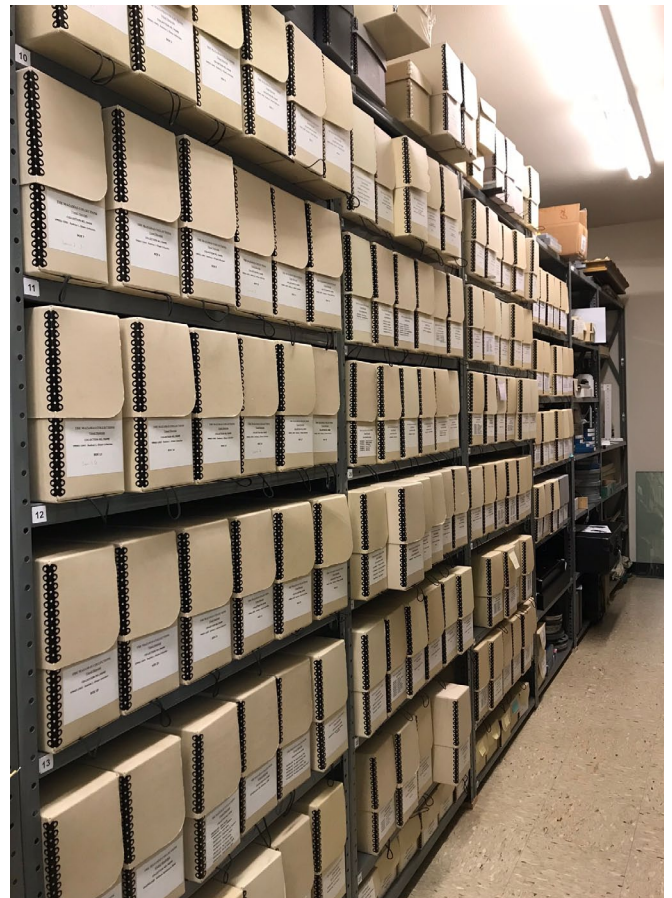
Mazama Library, Mazama Mountaineering Center, Portland, OR.