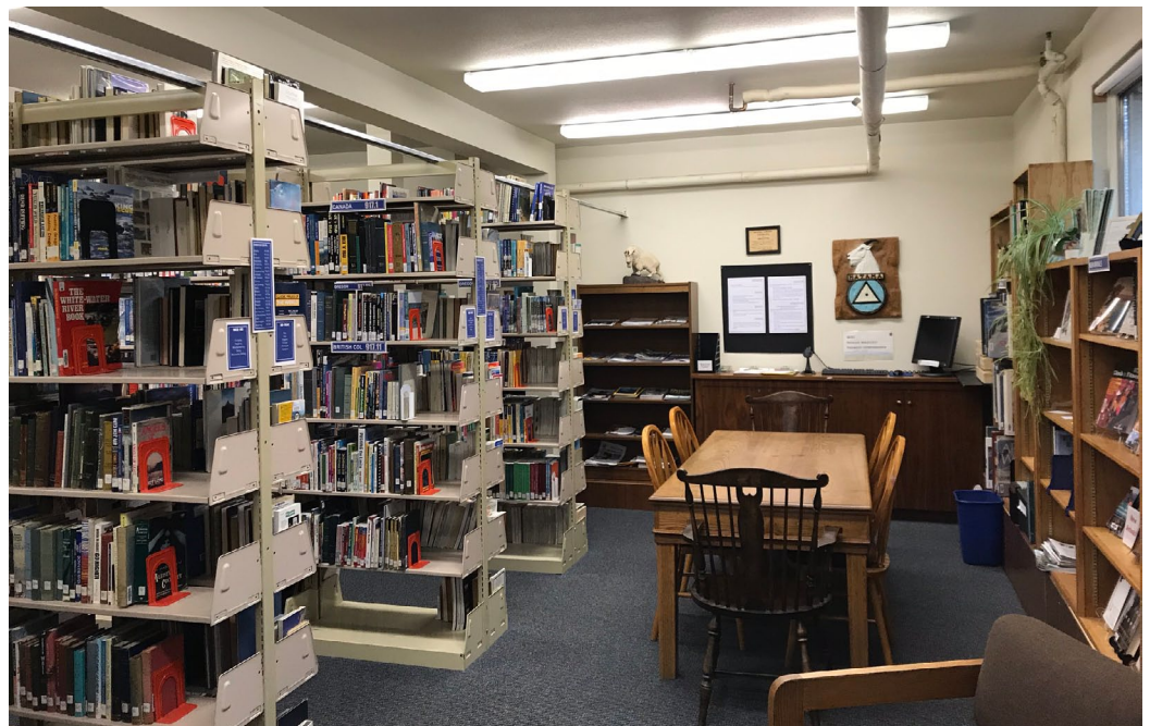
Mazama Library, Mazama Mountaineering Center, Portland, OR.

The Mazama Library, one-third of the Mazama Library and Historical Collections, is one of the few standalone mountaineering libraries operating in the United States today. Early photographs of the Mazama Clubrooms, as they were known then, reveal a small glass-fronted bookcase that showcased the first books in the Mazama Library. Over the next 102 years, the library acquired guidebooks, technical how-to titles, and rare books on mountaineering. Today, the library is significantly more extensive and strives to meet the varied needs of members, researchers, and the interested public.