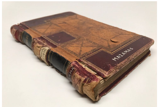
1915 Mount Hood summit register, Mazama Library and Historical Collections.

The two most-used collections in the Mazama archives are the summit register and glacier research collections. For almost eighty years, the Mazamas managed the registers on the summits of all the principal peaks in the Northwest. The logs, many in custom-made aluminum boxes designed and manufactured by the Mazamas, record the names of climbers and the date they reached the summit. The registers also encompass a wealth of observational data on the climate, geology, and glaciology of the mountains