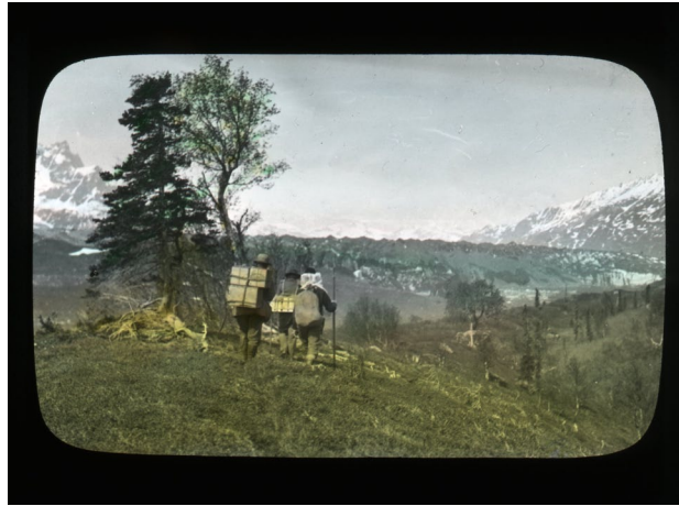
Lantern slide from the C.E. Rusk Collection.

cally valuable to Pacific Northwest mountaineering.