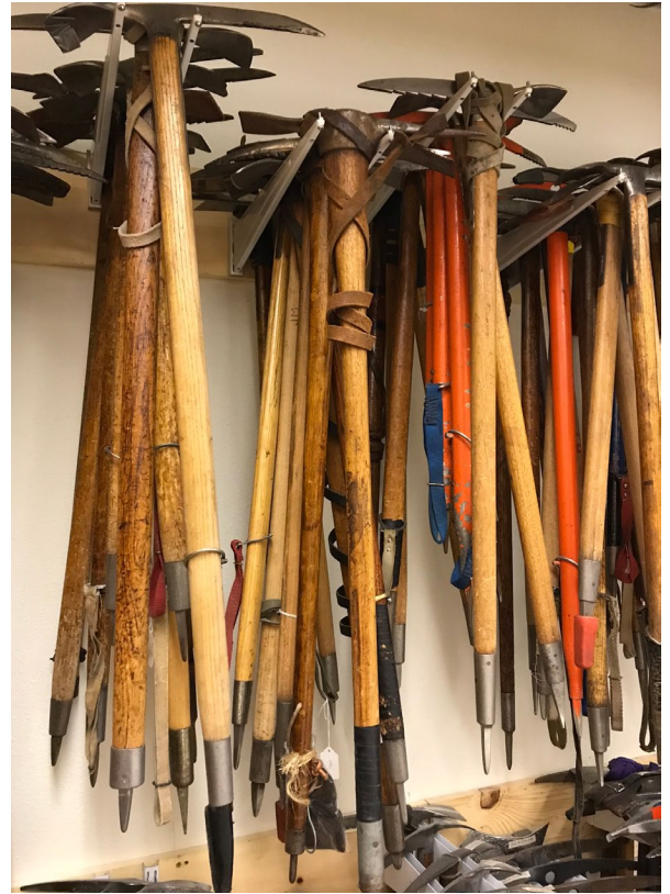
Historic ice ax collection, Mazama Library and Historical Collections.

Many climbing organizations have either significantly reduced their collections or eliminated their libraries entirely. The Mazamas have chosen a different path. In 2014, the executive council opted to expand the library and historical collections. The Mazamas have always been strong proponents of their history and have long supported their library. Surveys over the years uphold this assertion. The most recent, conducted in 2017, shows that 86 percent of the membership believes that the organization's collection of photographs, archival papers, and museum objects have strong historical value. Additionally, 60 percent of the membership is either aware of or has visited and used the library.