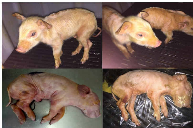
Fig. 1. The clinical signs and postmortem changes in piglets which died from PEDv during the first week of life

Molecular genetic methods RT-PCR were used for the diagnosis of PED. In samples of feces of diseased animals ( n = 29 ), PEDv RNA was identified at a concentration of 3.02 \times 10^7 \pm 9.45 \times 10^6 equivalent genes in 1 g of the biomaterial. The quantitative characteristics of the genomic material of PEDv are shown in Figure 2.