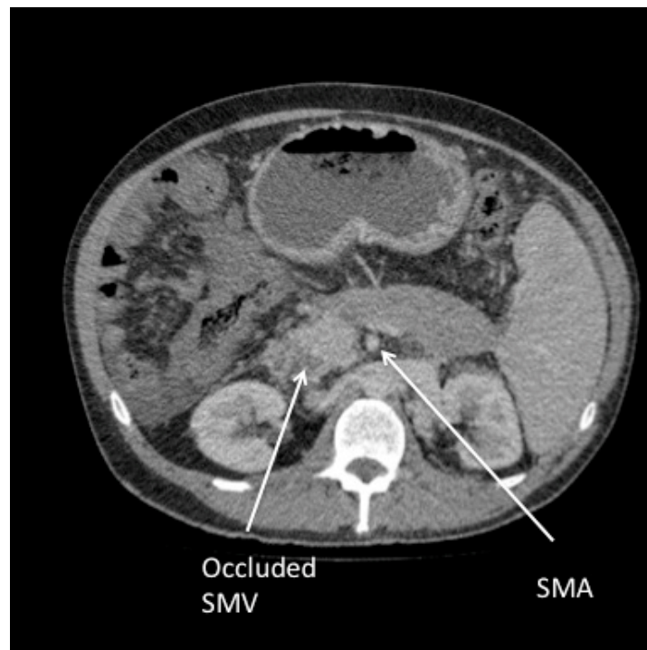
Figure 2. CT image showing extension of thrombus into the superior mesenteric vein (SMV) adjacent to the superior mesenteric artery (SMA).