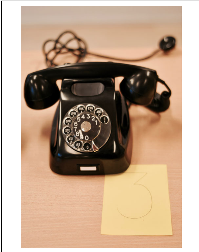
Figure 5. The “Model 3” rotary-dial Magneto M51, produced by Kristian Kirks Telefonfabrikker from 1951.

what it’s made of, but it is really nice (yes). A really nice old rotary phone that I regrettably threw out later for a simply—it was so beautiful, almost like an installation (yes); I think, for a time, we also had one in um the bedroom (okay)