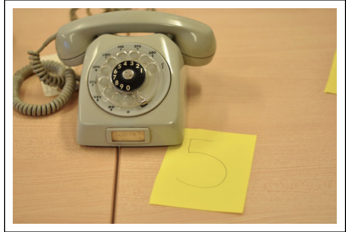
Figure 3. The “Model 5” rotary-dial F68, produced by L. M. Ericsson from 1968.