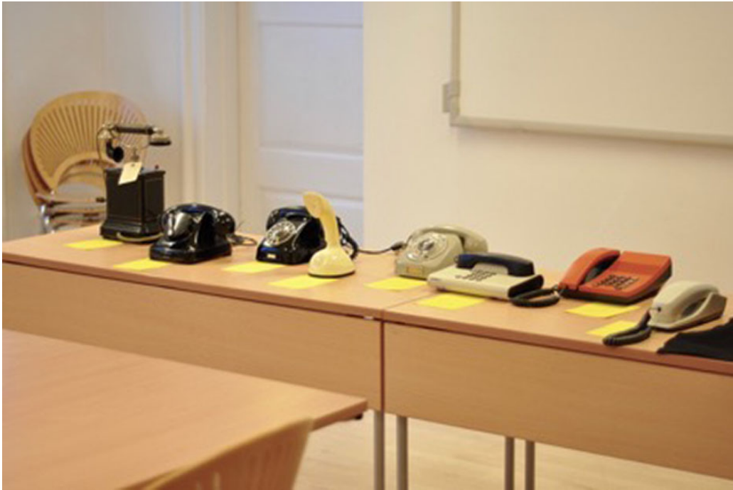
Figure 1. Telephone setup in interview room.

setup in the meeting room used for the interviews, with a corner of the cloth covering the mobile telephones seen on the right and the table used for the interviews in the foreground. Figure 2 shows the same setup from another angle, with no cover over the mobile telephones.