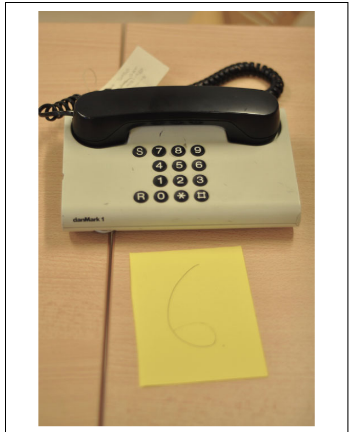
Figure 4. The “Model 6” push-button telephone DA80, produced by GNT Automatic from 1980.

Tina is here using the telephone setup as a checklist, running through her memories of owning telephone models at different times in her life: I had this one, and the next, but not that one. Since the telephones on display were produced in an era in which there were few models on the market, many participants recognized all models and could remember who in their family or friend circle owned those models that were absent from their own home. In this way, the telephones worked as a way of sorting out the sequences