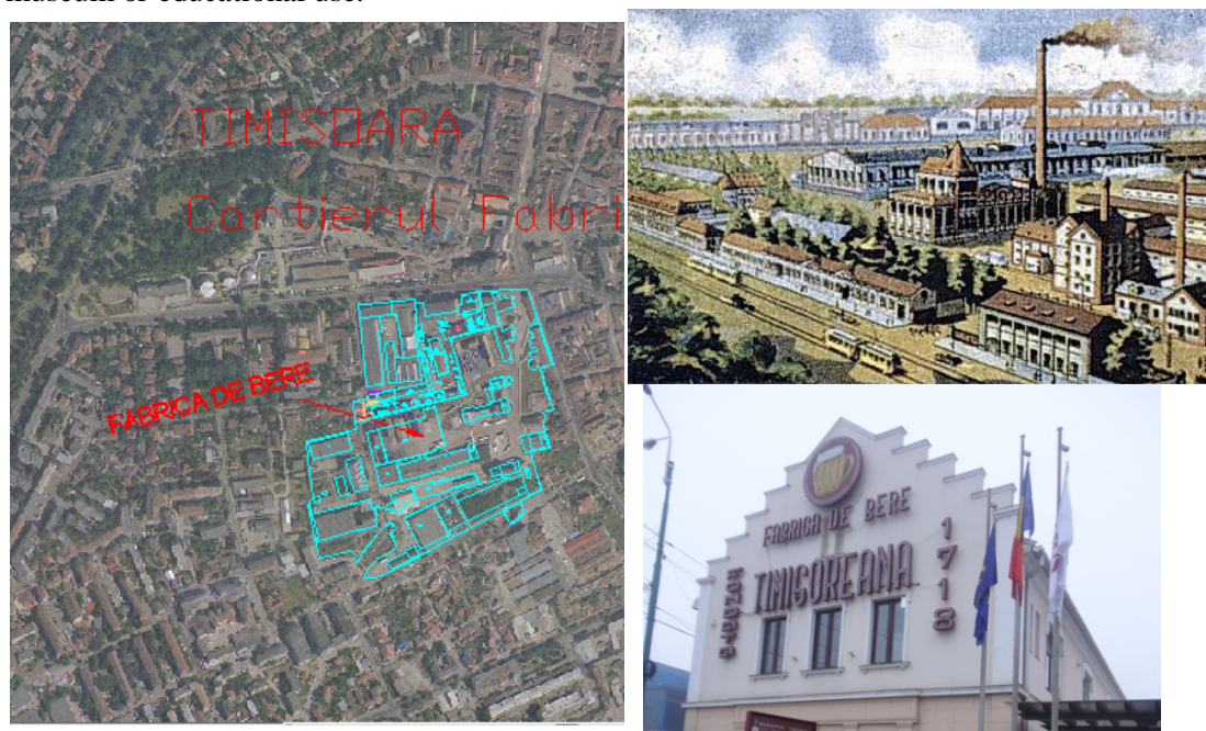
Fig. 2. Example of inland (brownfield) sites

The inland (brownfield) sites consist in industrial areas that because of urban development, specifically through continuous urban sprawl, end up to be surrounded by residential areas. Fabric area is a good example of an inland (brownfield) site (Figure 2). For the redevelopment of this type of brownfield site, it should be taken into account the previous industry type, the type of pollution and the time necessary for remediation. The inland (brownfield) sites are attractive for residential use, business or shopping centres and museum or educational use.