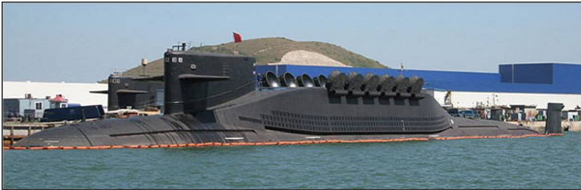
Figure 1. Jin (Type 094) Class Ballistic Missile Submarine