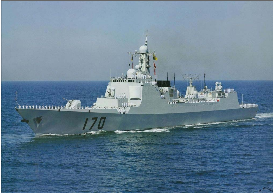
Figure 6. Luyang II (Type 052C) Class Destroyer