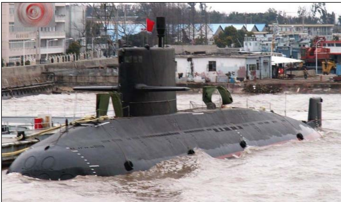
Figure 2. Yuan (Type 041) Class Attack Submarine