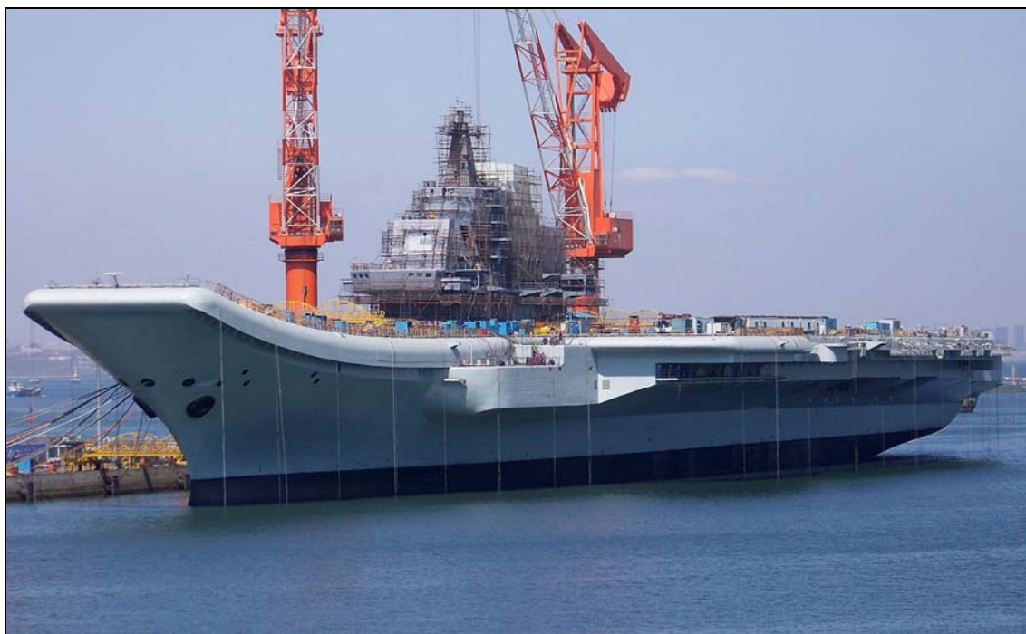
Figure 5. Ex-Ukrainian Carrier Varyag Being Completed at Shipyard in Dalian, China