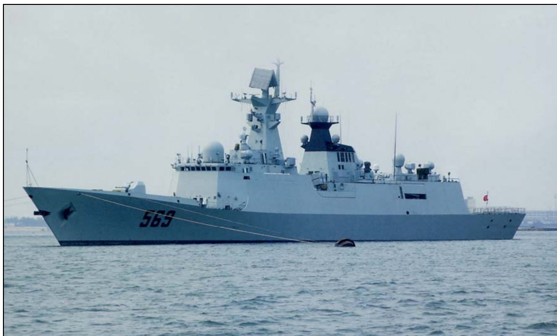
Figure 7. Jiangkai II (Type 054A) Class Frigate