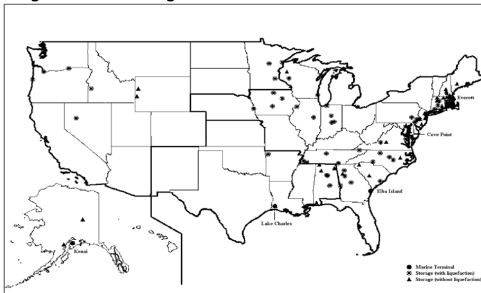
Figure 2: LNG Storage Sites in Utilities and Marine Terminals