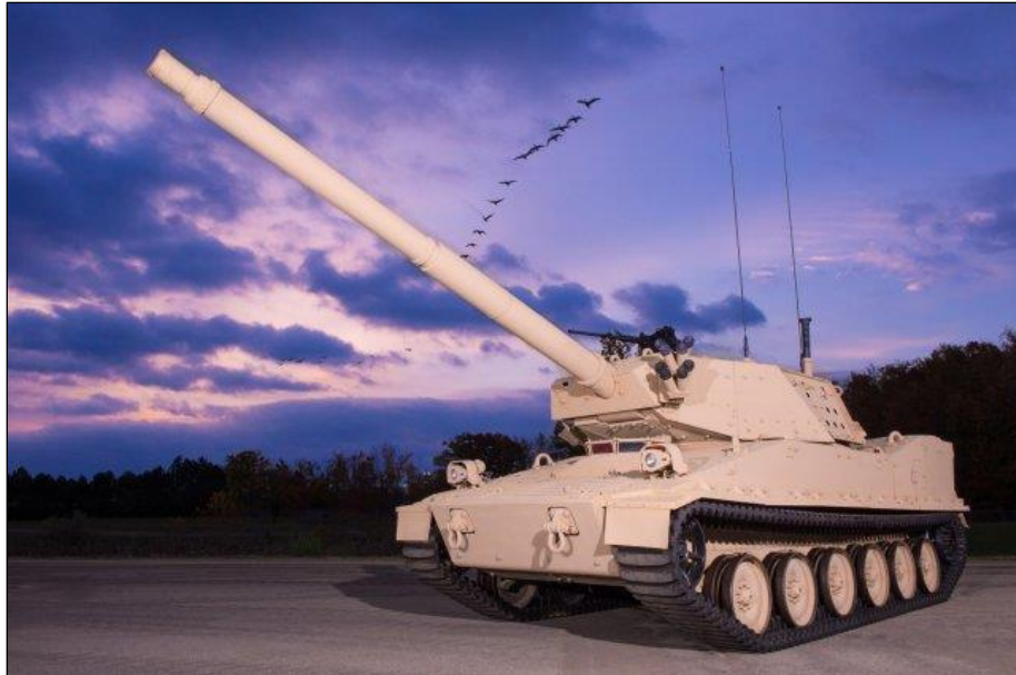
Figure 3. Illustrative MPF