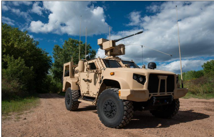
Figure 2. Illustrative LRV