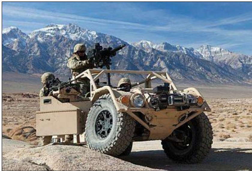
Figure 1. Illustrative GMV