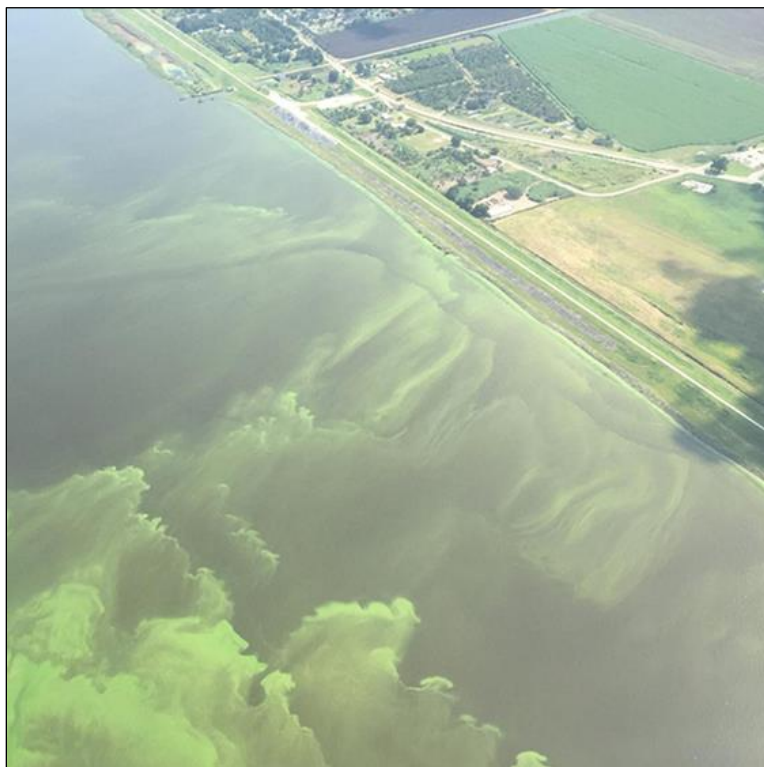
Figure 1. Aerial view of a July 2016 Harmful Algal Bloom in Lake Okeechobee, Florida