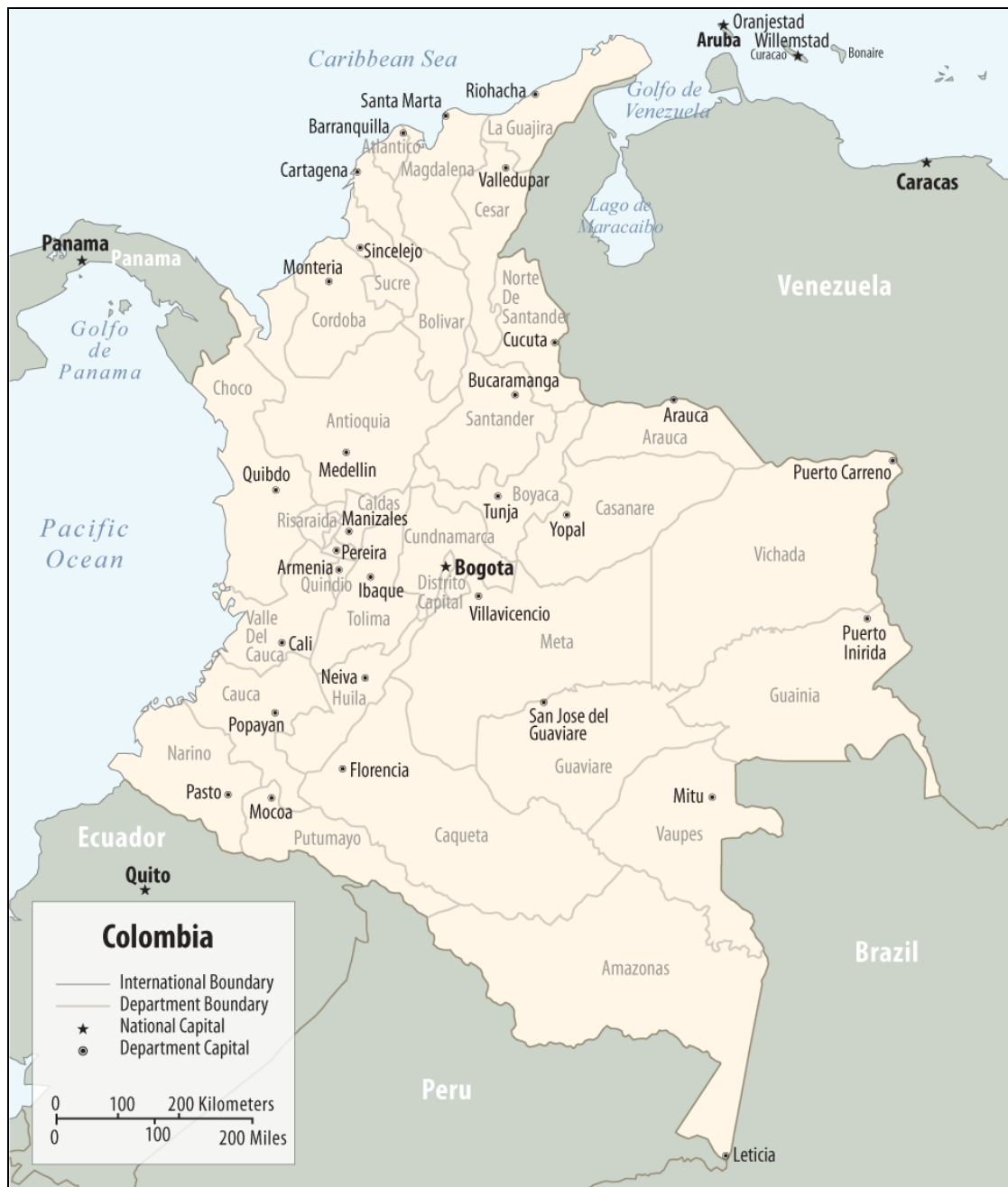
Figure I. Map of Colombia

illegally armed groups made aggressive efforts to take control of former FARC territory and its criminal enterprises as FARC forces withdrew. (For more, see “The Current Security Environment,” below.)