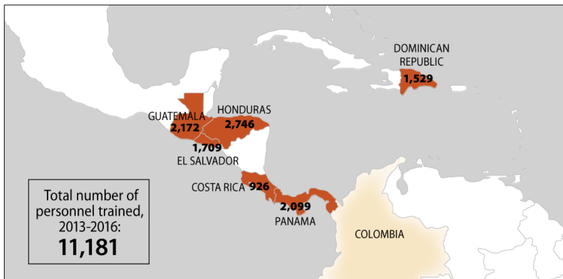
Figure 2. Third-Country Security Forces Trained Under the Action Plan on Regional Security Cooperation, 2013-2016

Source: Data from the Colombian Ministry of Defense provided by the Embassy of Colombia.