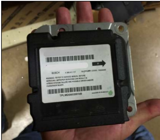
Figure 1. An Event Data Recorder