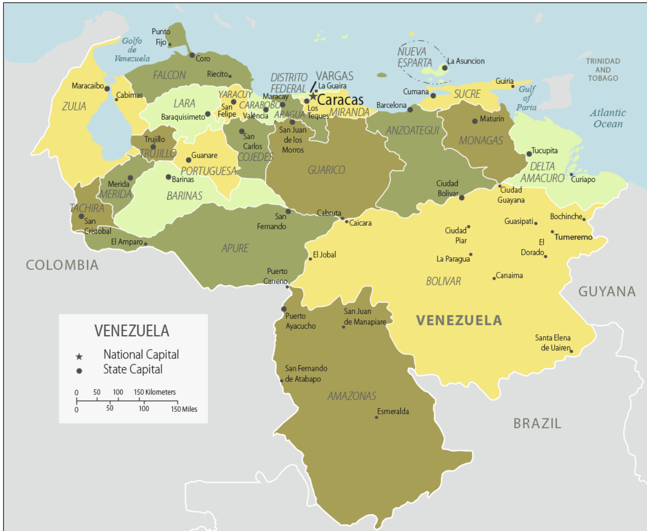
Figure I. Map of Venezuela