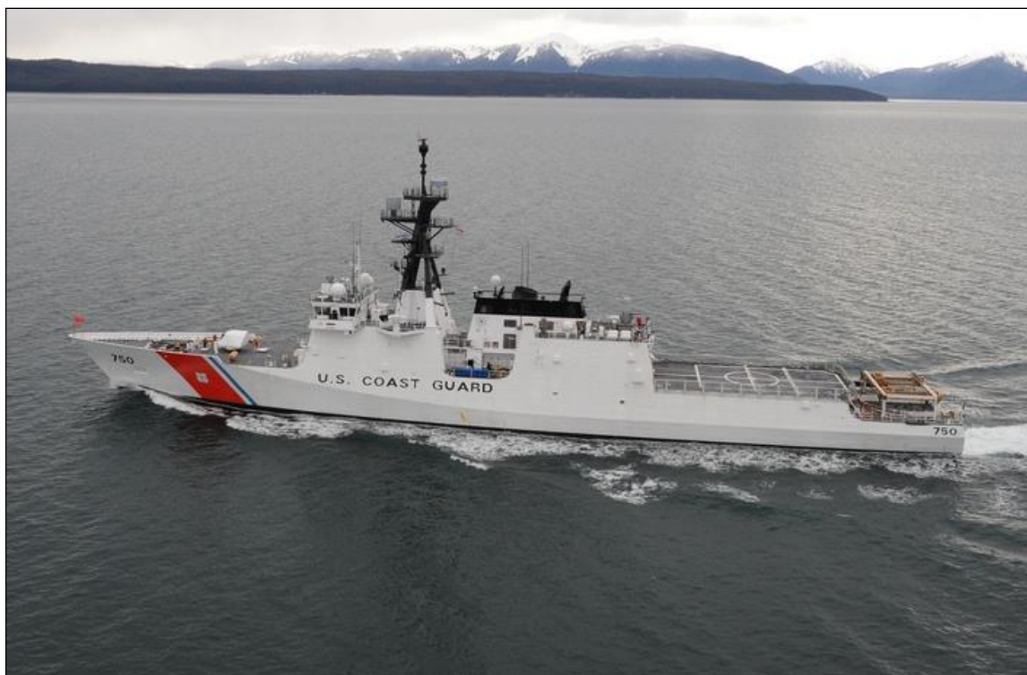
Figure 1. National Security Cutter