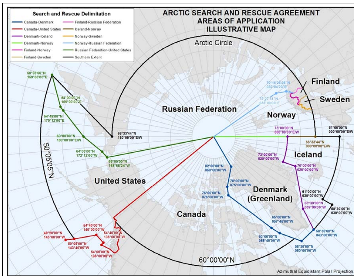
Figure 4. Illustrative Map of Arctic SAR Areas in Arctic SAR Agreement (Based on geographic coordinates listed in the agreement)