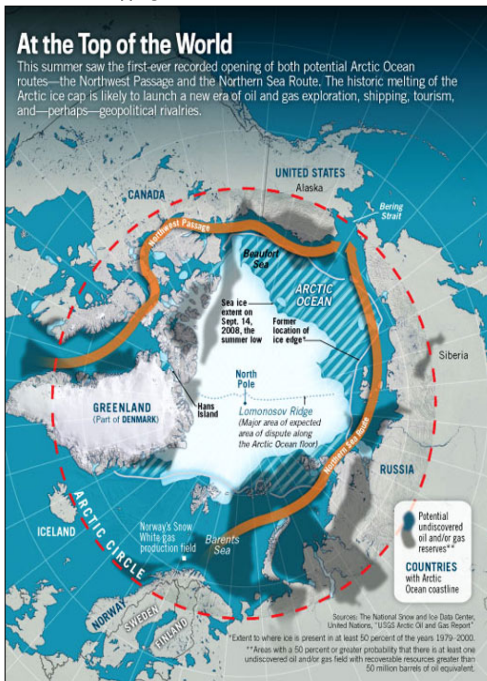
Figure 3. Arctic Sea Ice Extent in September 2008, Compared with Prospective Shipping Routes and Oil and Gas Resources