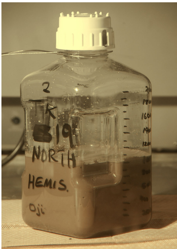
Figure 1 Unsettled Tank 19F Composite sample slurry from the North Hemisphere.