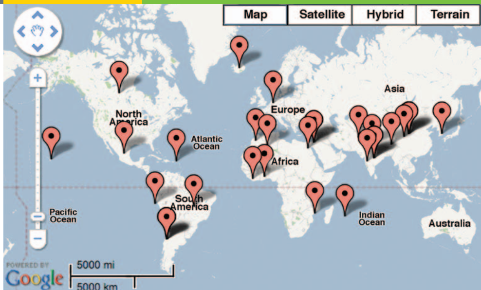
OpenLabs Feature: Interactive Map of U.S. National Laboratory International Initiatives