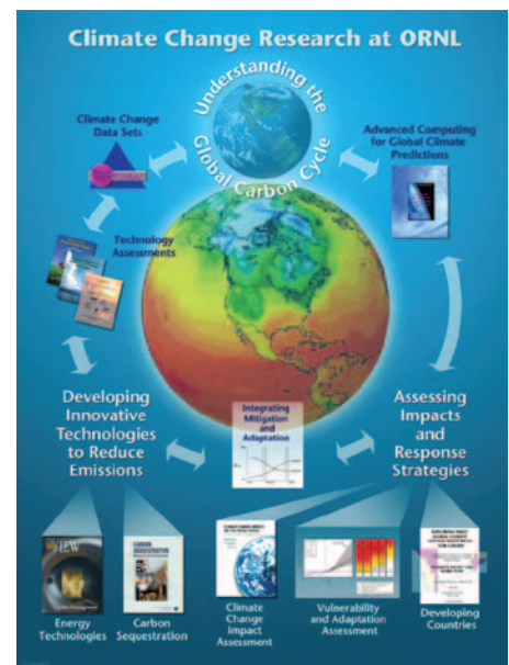
Structure of Climate Change Research at ORNL

Please visit openei.org/uslabs to explore all of the site's features. The network also welcomes your feedback on improvements for the site, which will be expanded over time. Suggestions on additional tools and resources from the U.S. national laboratories that should be included are also welcome. Please contact Sadie Cox at sadie.cox@nrel.gov for more information.