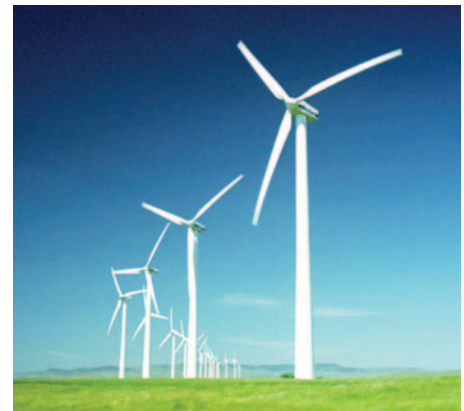
Wind energy project