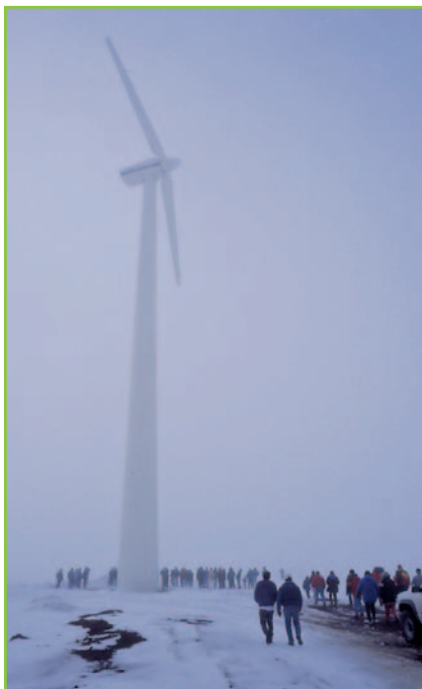
Commissioning and blessing of the St. Paul power plant.

TDX is currently working with the City of St. Paul to interconnect two additional Vestas V27 turbines installed over winter 2007 to the City of St. Paul Municipal Electric Utility. This would interconnect the industrial complex power system with 725 kW of installed wind capacity to the cities' utility electric system, driven by a 2.1-MW diesel power station and having an average load of more than 600 kW. With a minimum load close to 400 kW, once interconnected the wind will supply a large amount of the power for the community, and depending on the final selection of control hardware, will represent a high-penetration power system for the entire St. Paul community.