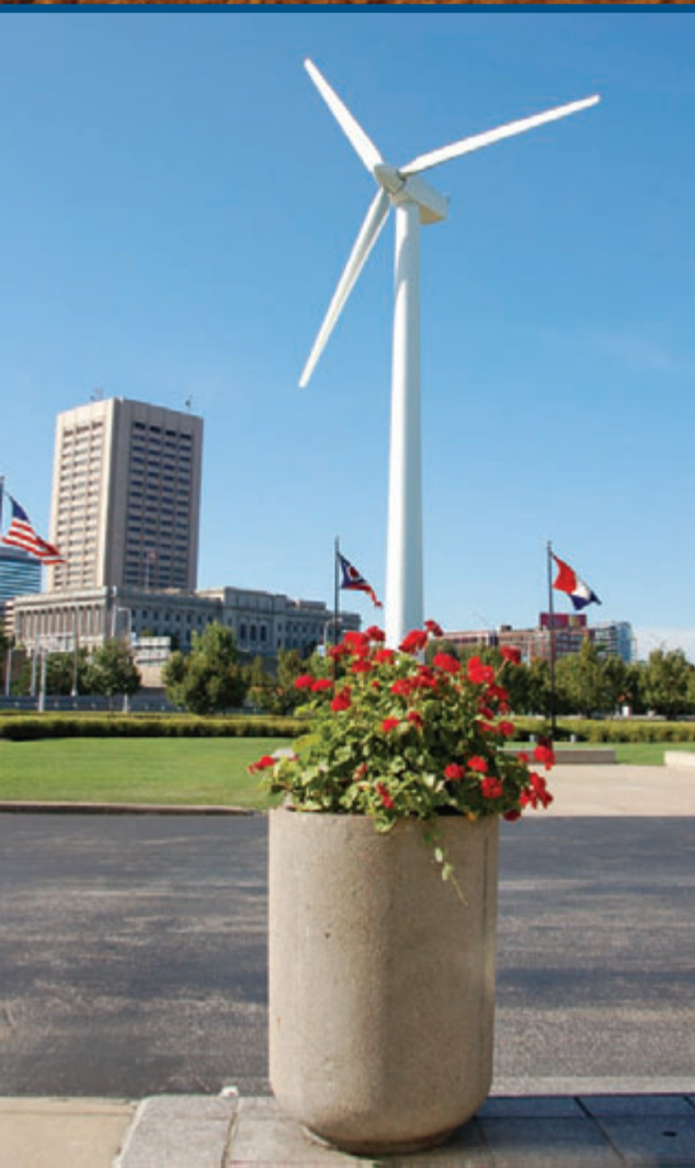
Tom Maves/PX1 4826