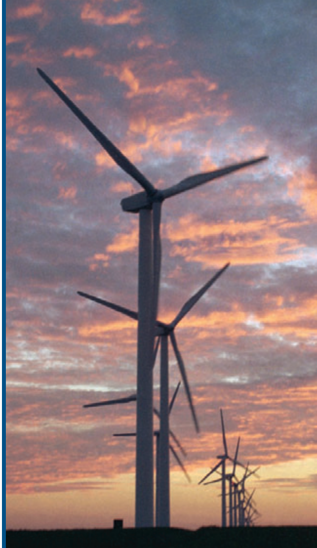
Warren Grez, NREL/PX00280