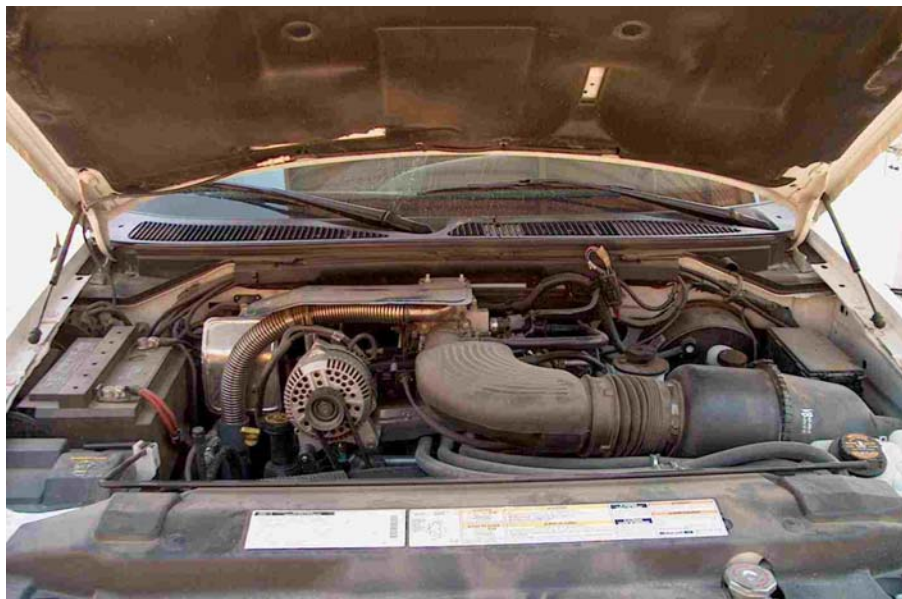
Figure 2. Low-percentage-blend F-150 engine compartment.