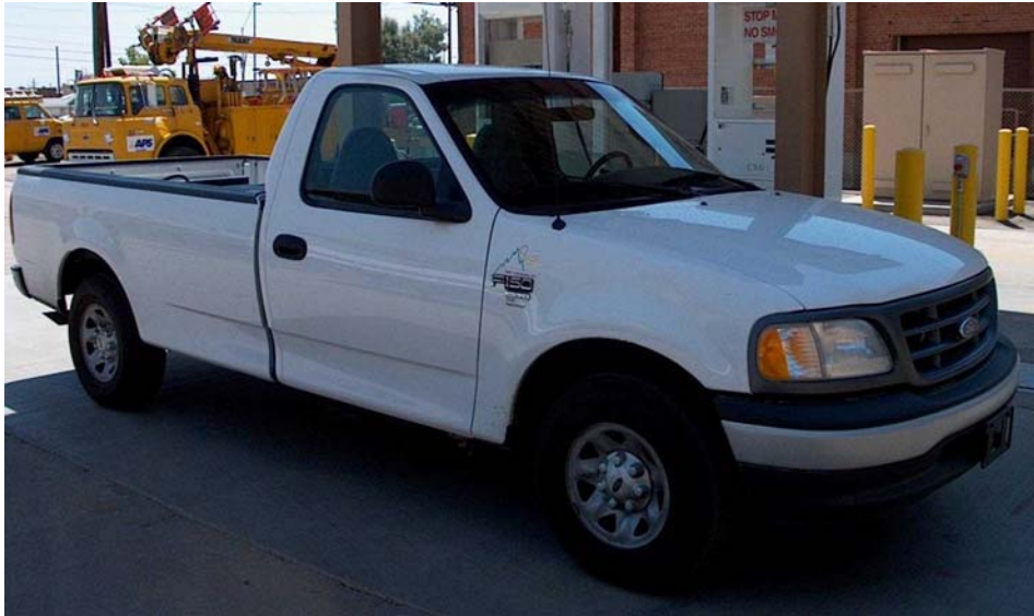
Figure 1. Low-percentage-blend F-150.

This low percentage blend HCNG test vehicle is a model year 2000 F-150 originally equipped with a factory CNG engine, specifications listed in Table 2. It was modified by NRG Technologies in Reno, Nevada to run on a blend of CNG and 28% hydrogen (by volume). NRG Technologies modifications include adding a supercharger, making ignition modifications, and adding an exhaust gas re-circulator. The vehicle utilizes the factory installed carbon steel CNG fuel tank. The tank operates at 3600 psig. APS began testing this vehicle in June of 2001.