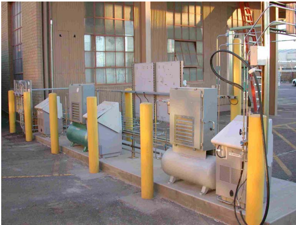
Figure 4. FuelMaker with HCNG mixer.

Inasmuch as the FuelMakers are not equipped with a fuel measurement system, fuel efficiency over the time period before July 5, 2002 can only be estimated. From July 5 until August 9, the F-150 logged 1,776 miles and used 282.3 kg of blended fuel. This translates to a fuel efficiency of 15.7 miles per gasoline gallon equivalent (gge) over this time period. See Appendix B for a monthly fuel and mileage summary.