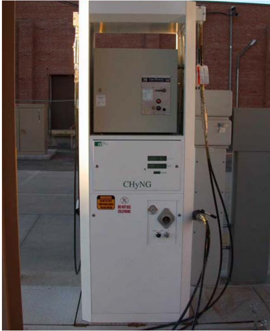
Figure 5. FTI blended fuel dispenser.