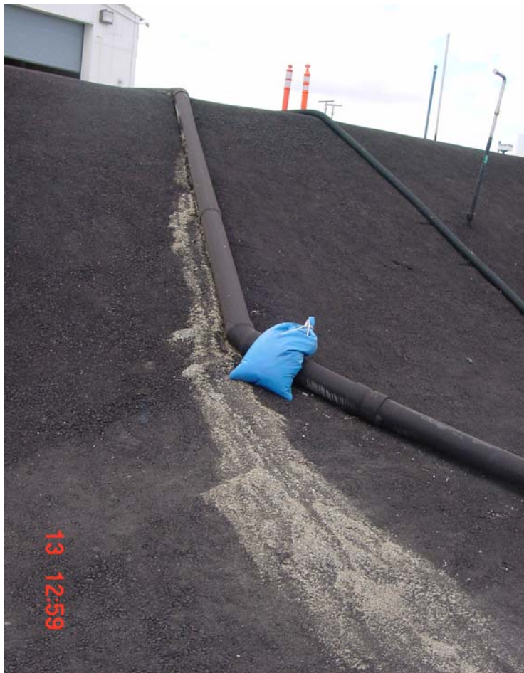
Figure B-2. Drain line over Site CPP-79 separated from asphalt and allowed water to get under asphalt layer.