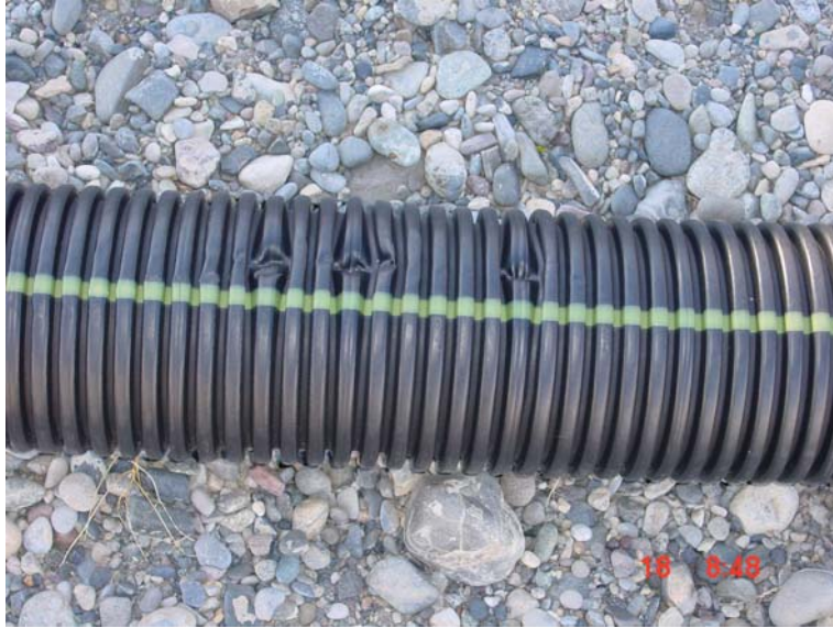
Figure B-1. Damage to high-density polyethylene pipe that drains Sites CPP-28 and -79.