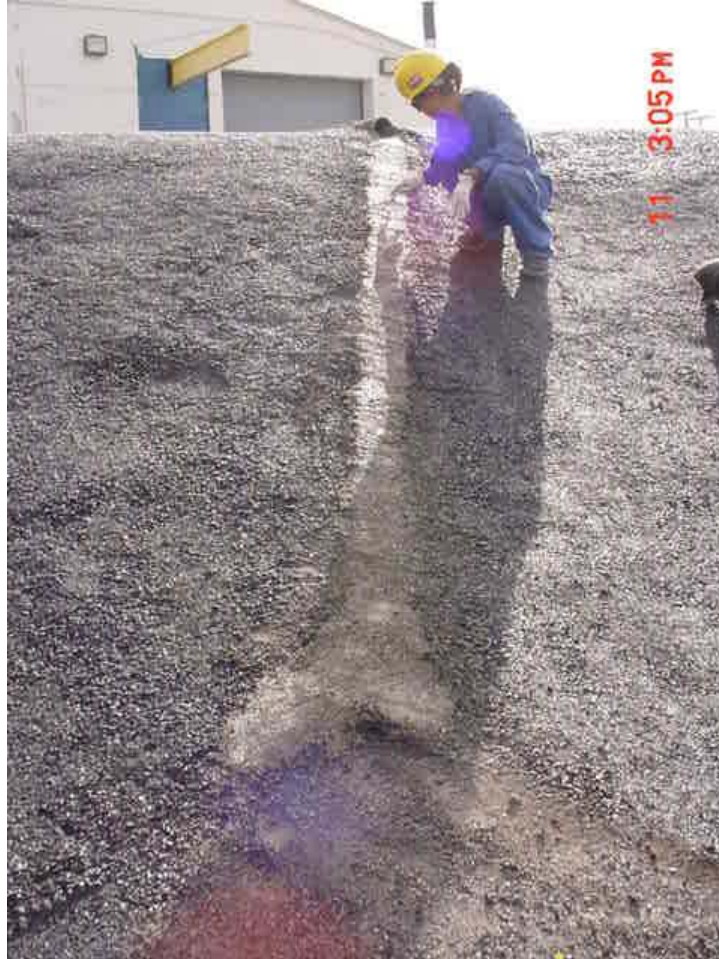
Figure B-3. Lower part of drain line over Site CPP-79 removed and depression filled in with concrete.