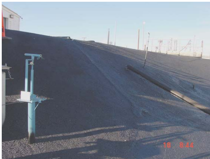
Figure B-4. Showing drain line over Site CPP-79 removed, depression filled in with concrete, and area sealed with seal coat.