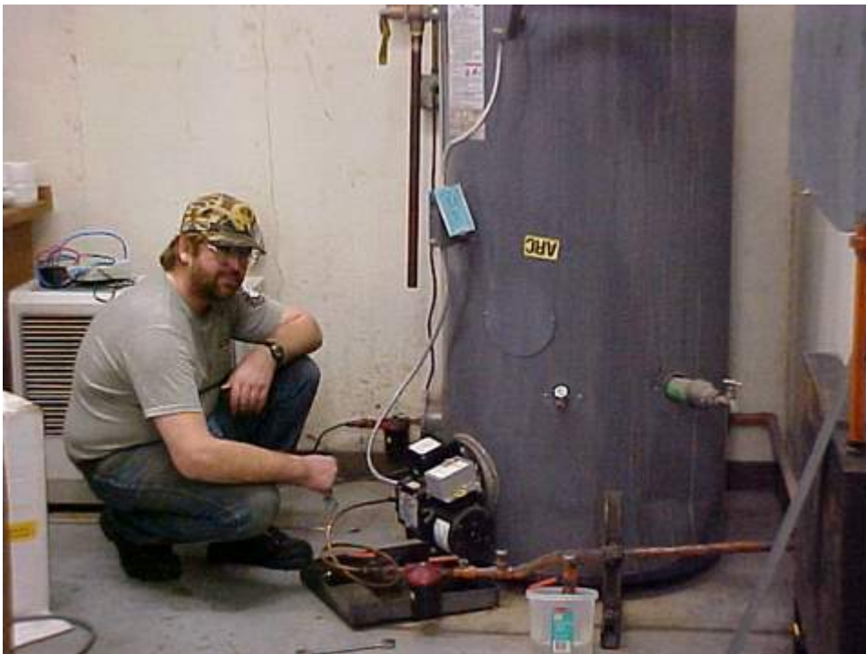
Figure 16 Commercial fuel efficiency testing