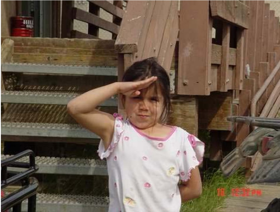
Figure 13 Reporting for duty, Sir Youth Energy Patrol