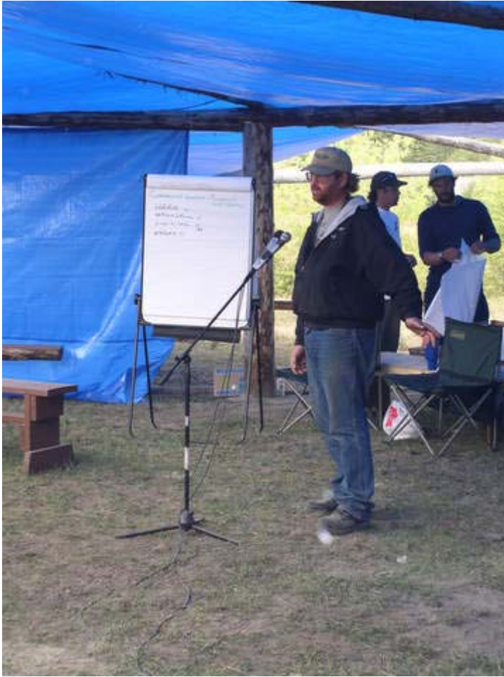
Figure 7 Presentations at various large gatherings to promote RE