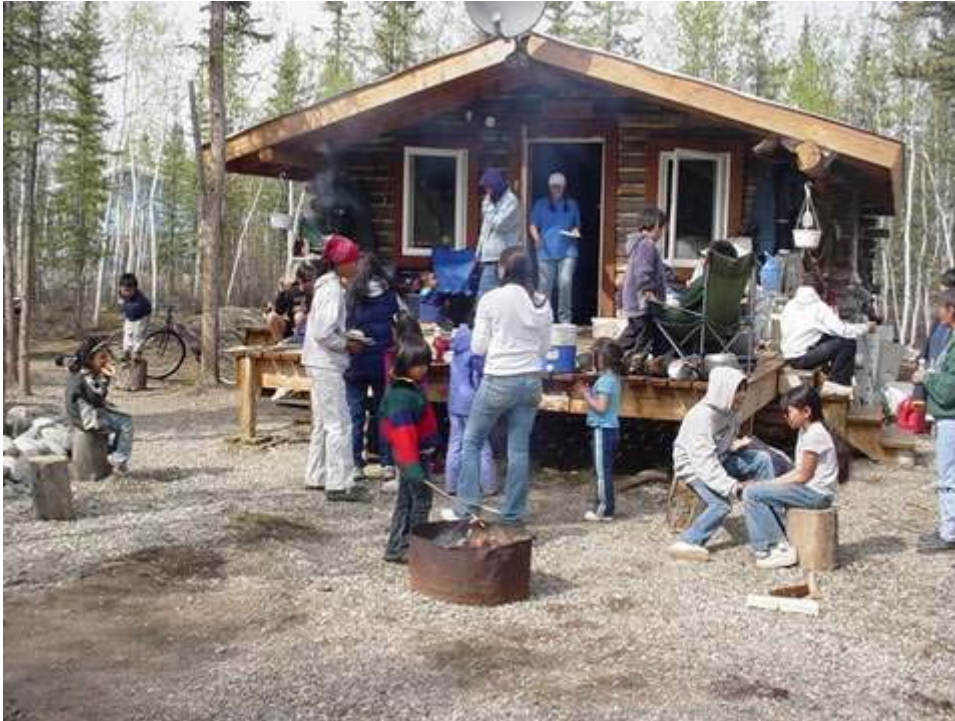
Figure 19 Home Energy Audits