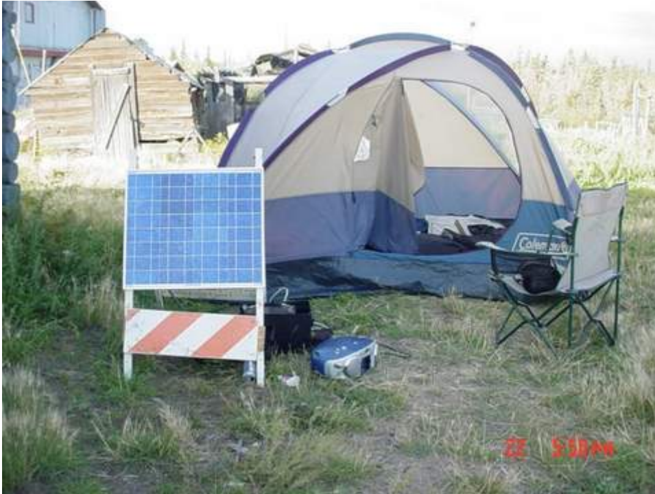
Figure 6 Education through practacle applications