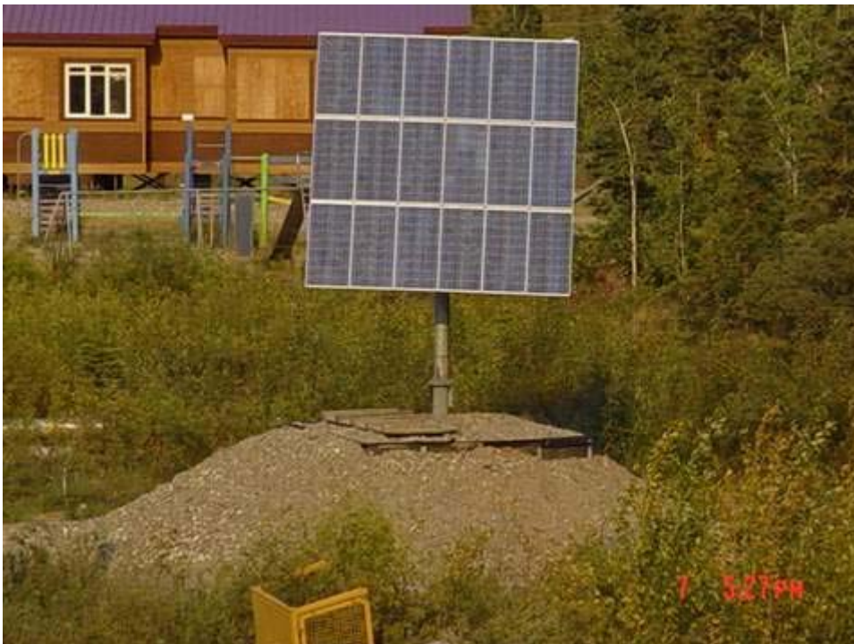
Figure 4 Venetie Tracking Array