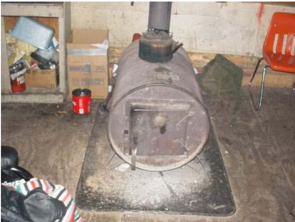
Figure 32 Traditional Heating sources