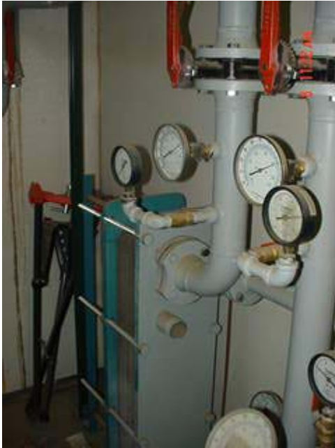
Figure 27 Waste Heat Recovery