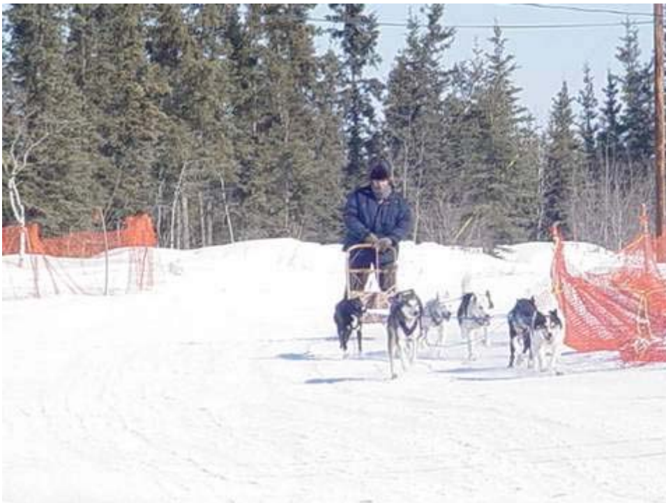
Figure 30 Traditional Transportation Techniques