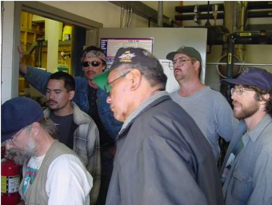
Figure 10 Local Installation/Maintenance skills