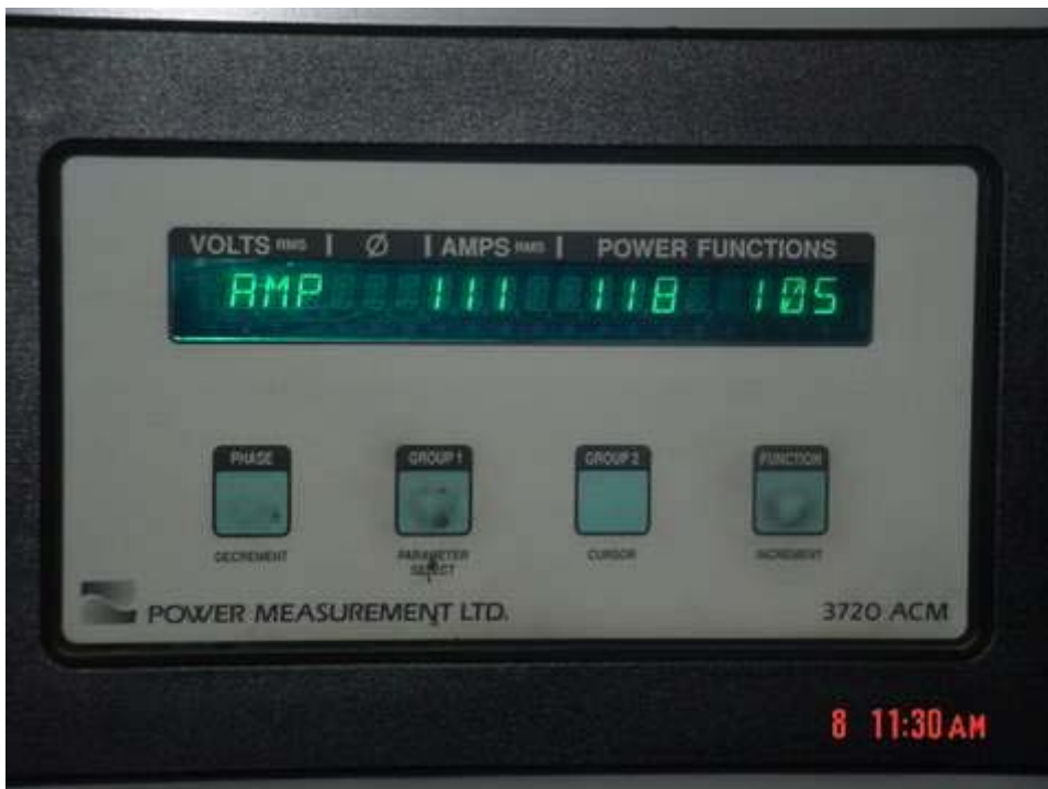
Figure 26 Line Equalization monitoring