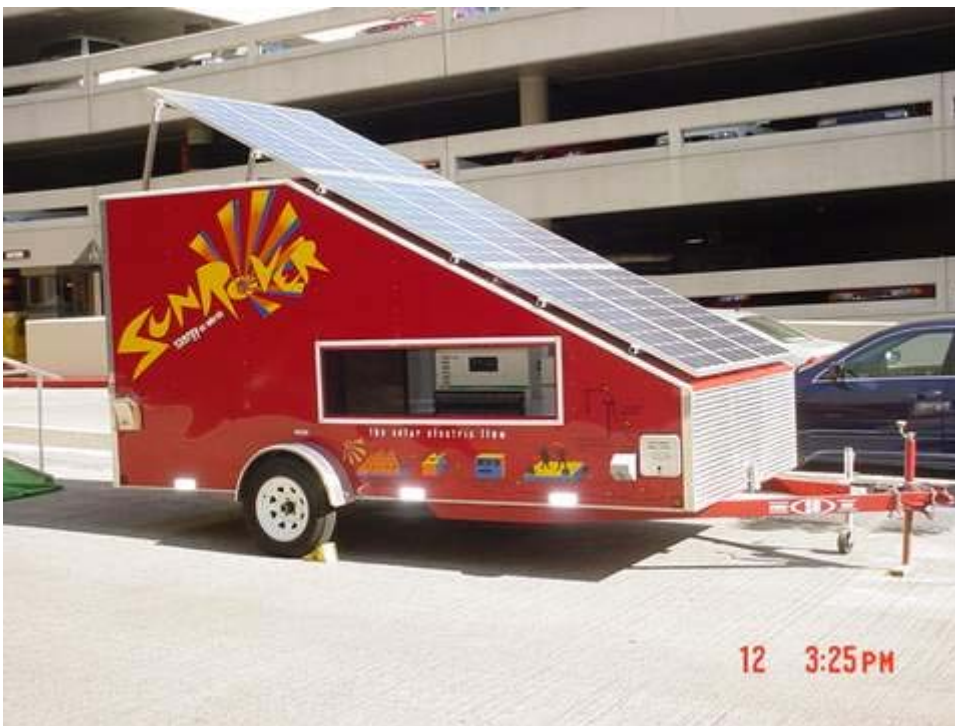
Figure 28 Attending RE events Solar Fair Portland, Ore