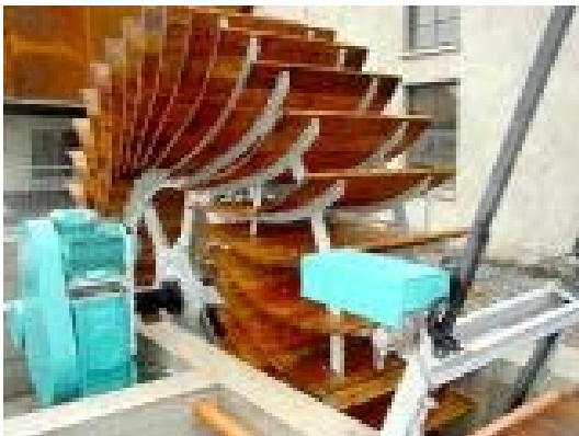
Figure 35 Water Wheel Generators