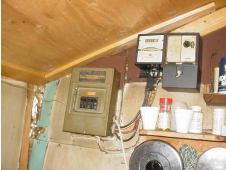
Figure 37 Pay as you go metering