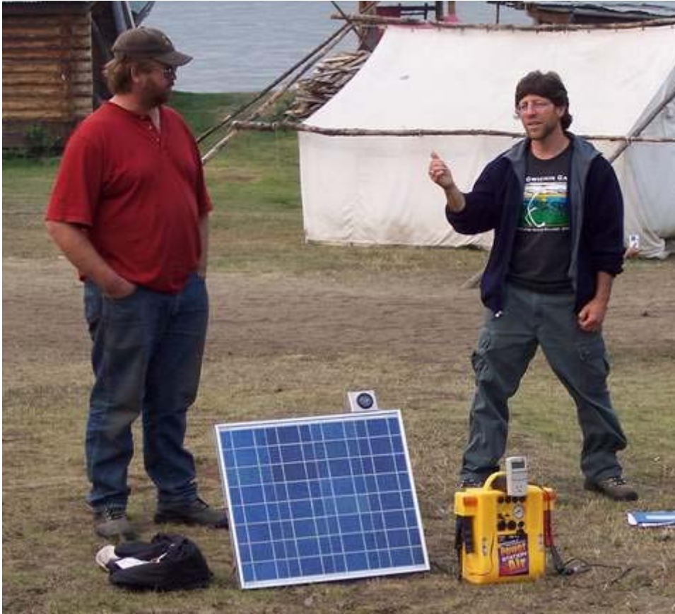
Figure 5 Renewable Energy Education presentations