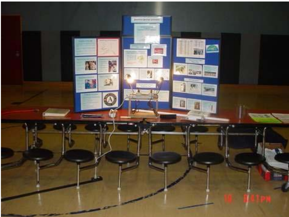
Figure 12 Community Energy Fair