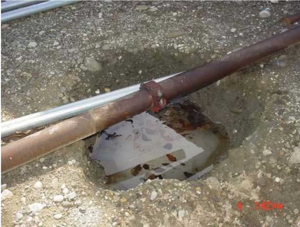
Figure 25 Fuel Tracking 2