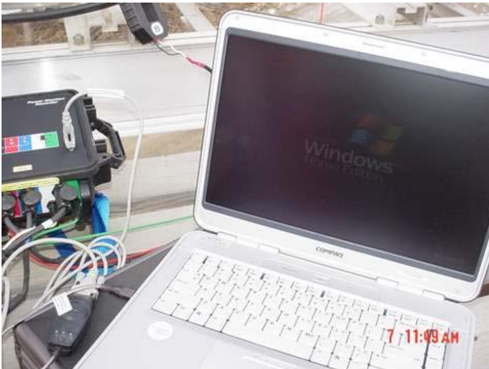
Figure 14 Energy Tracking 1