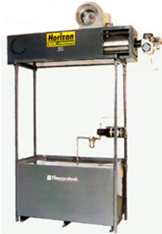
Figure 18 Used Oil Heaters