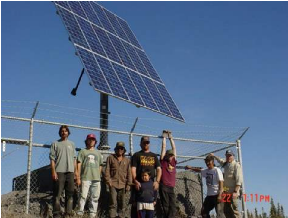
Figure 2 Arctic Village Tracking Array