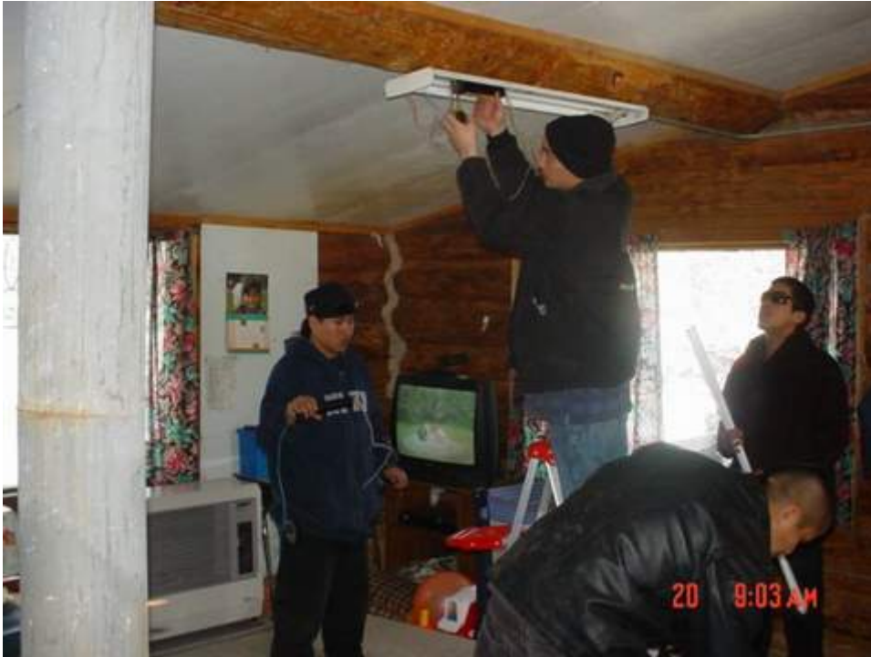
Figure 11 Energy Conservation Project team