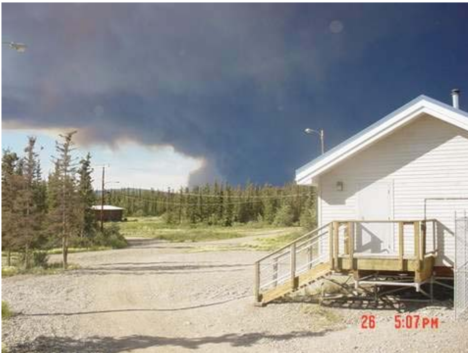
Figure 20 RE for Emergency Communications....Forest Fire 1 mile away