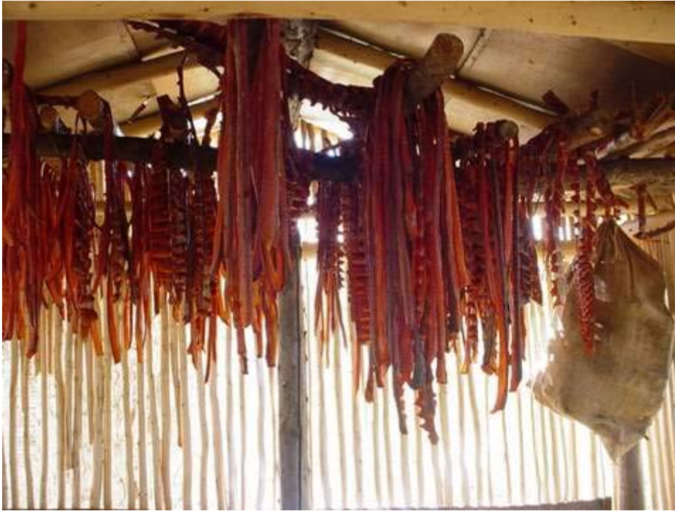
Figure 29 Traditional Food Preservation techniques 1