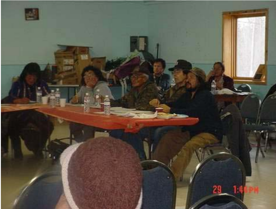
Figure 9 Tribal Energy Summit - 3 Councils