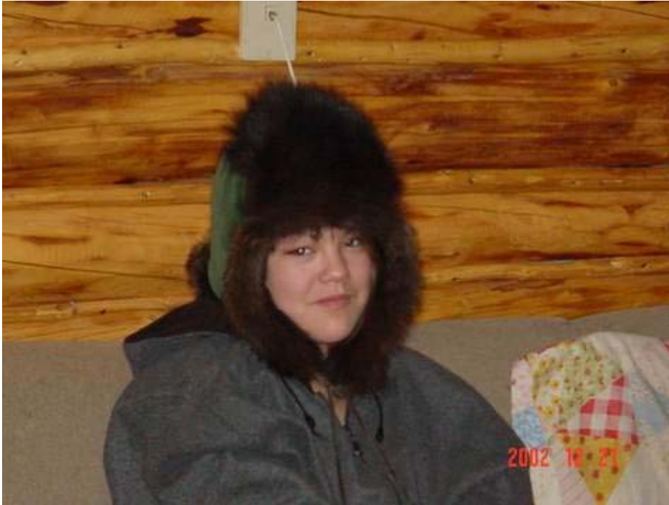
Figure 31 Lower Home Thermostats