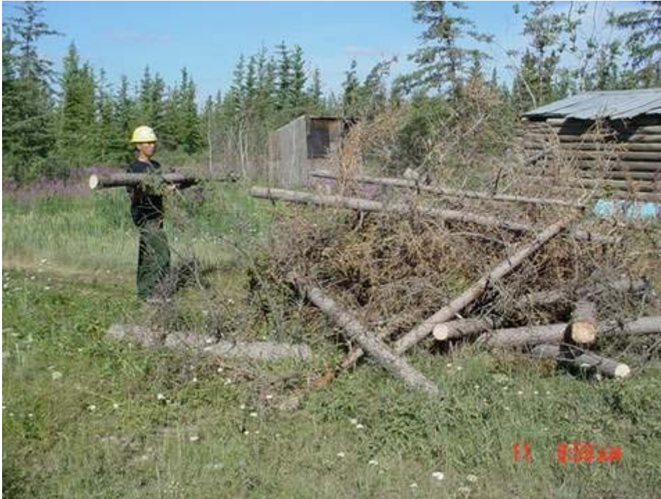
Figure 21 Wood resources inventory