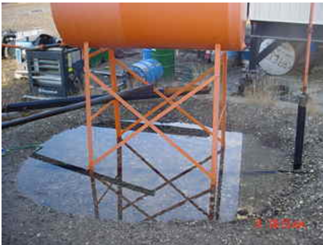
Figure 24 Fuel Tracking 1