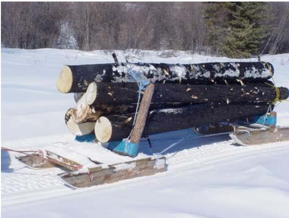
Figure 22 Post fire recovery of fuels