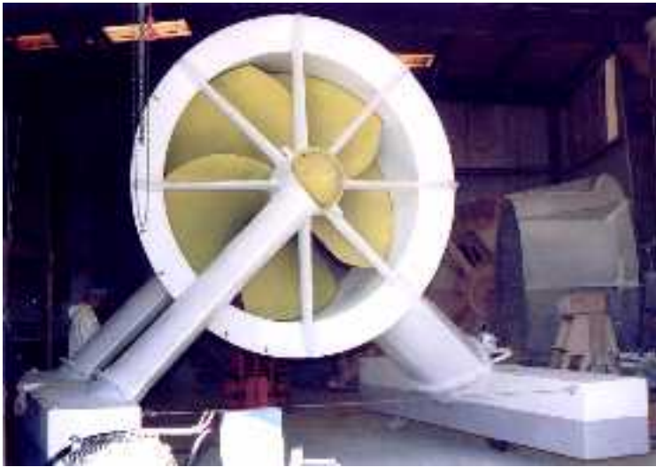
Figure 34 New Tech Run of River Hydro