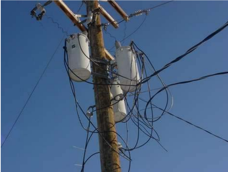
Figure 23 Distribution upgrades/Line equalizations