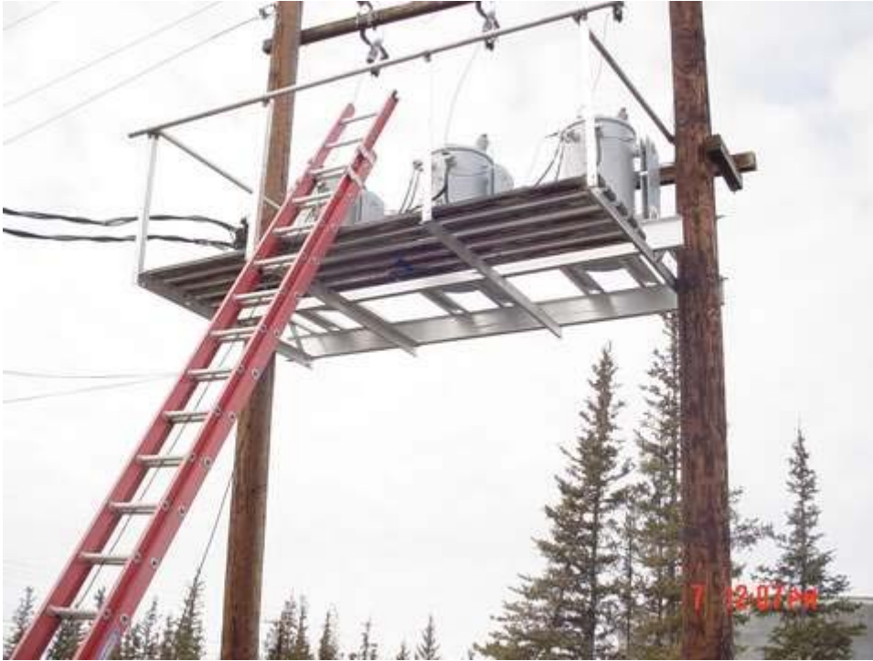
Figure 15 Line monitoring Setup