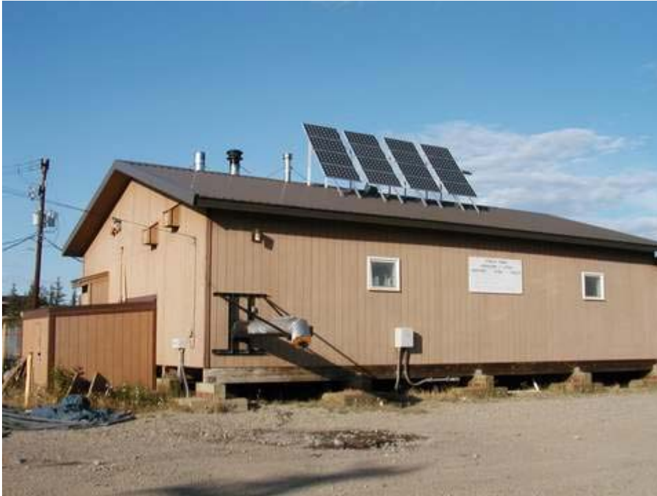
Figure 3 Venetie Fixed Array