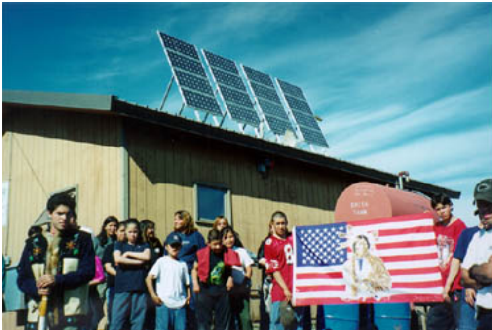
Figure 38 Thank You USDOE