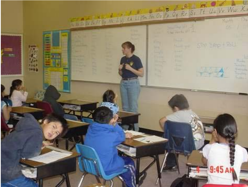
Figure 17 Energy Curriculum in Schools