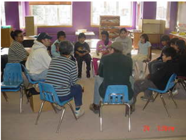
Figure 8 Presentations in local schools