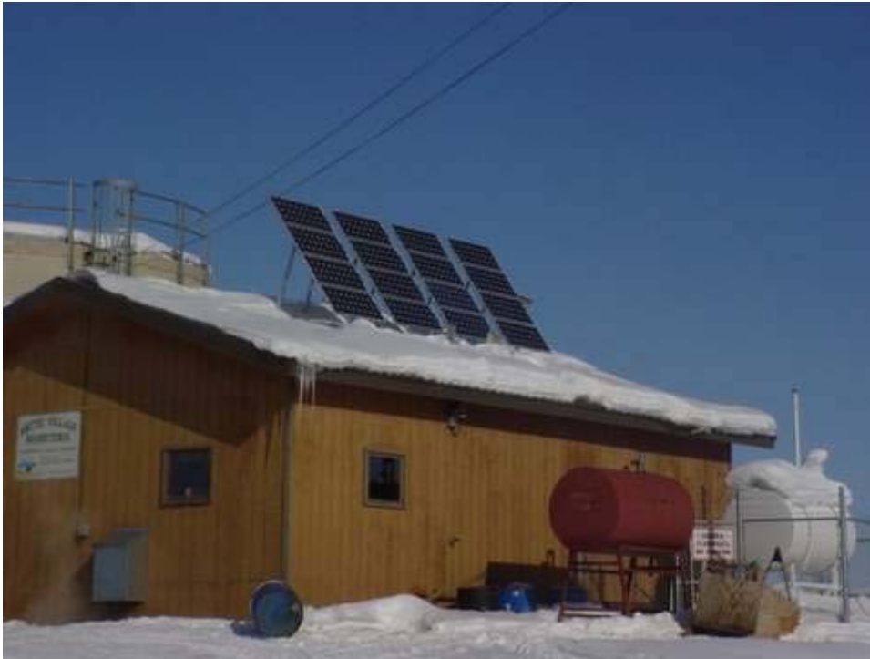
Figure 1 Arctic Village Fixed Array