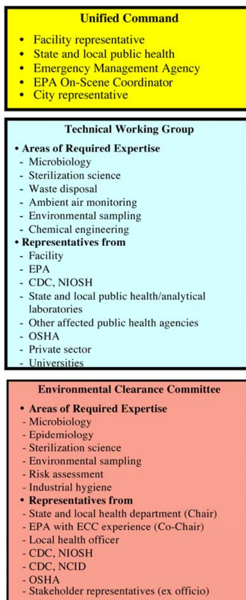
Figure A-3. Components of the UC, TWG, and ECC during consequence management.