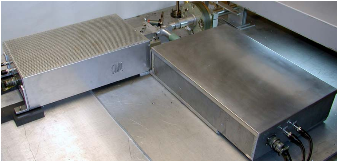
Figure 1. Dual receiver millimeter-wave thermal analysis instrumentation set up on a laboratory furnace at MIT.

The resulting instrumentation was recognized this year with a R&D 100 Award as one of the most significant technological developments in 2006. The dual receiver thermal analysis instrumentation is shown in Figure 1.