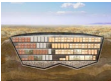
The Integrated Disposal Facility is a 60-acre landfill that is being constructed in the 200 East Area of the Hanford Site.

Scientists and engineers from PNNL estimated possible radionuclide release rates from the bulk vitrification waste product that is to be disposed in the Integrated Disposal Facility.