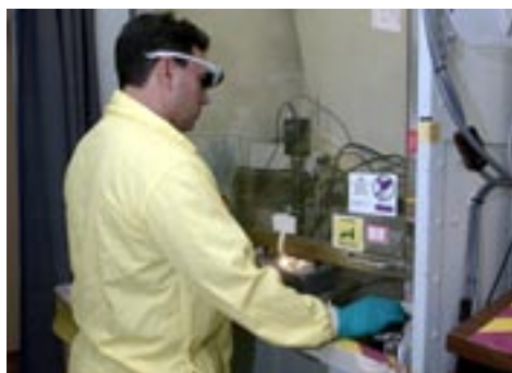
Scanning electron microscope images of the glass/block interface help researchers assess how well the waste will lock in certain elements.

At PNNL, the research team conducted dissolution tests to examine the corrosion behavior of glass in water over a wide range of conditions. The results were used to develop the parameters needed to conduct performance assessment calculations of the long-term interaction of disposed glass with water. These calculations were carried out with a PNNL reactive transport computer model. Preliminary results suggest that bulk vitrification glass follows dissolution patterns that are very similar to those of the glass being formulated for the Waste Treatment Plant.