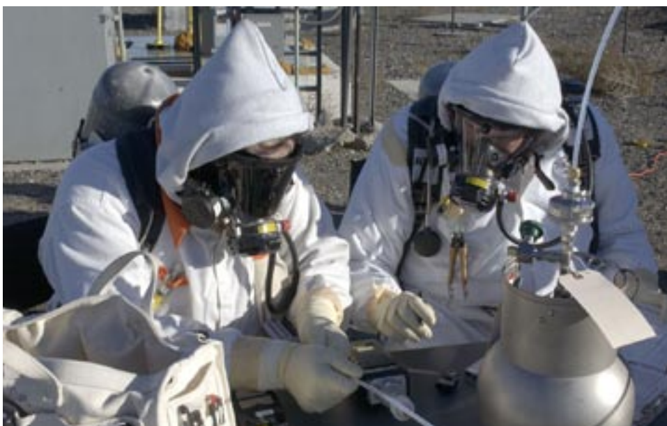
U.S. Department of Energy

Researchers at PNNL also conducted chemical and toxicological evaluations to determine which of the hundreds of vapors present in the tank headspaces have been detected at levels of concern, and then assigned acceptable occupational exposure guidelines to many of the vapors of concern that lacked national guidelines. PNNL toxicologists conducted reviews of the available literature and established headspace concentration screening values for about 600 of the vapors. These screening values were then compared with the maximum observed headspace concentrations to identify the chemicals that needed further evaluation. More thorough toxicological evaluations are being conducted to establish acceptable occupational exposure limits that will be incorporated into the industrial hygiene strategy for tank farm worker protection. These engineering efforts helped to bound the vapor problem and allowed the CH2M HILL industrial hygiene staff to develop suitable area monitoring strategies.