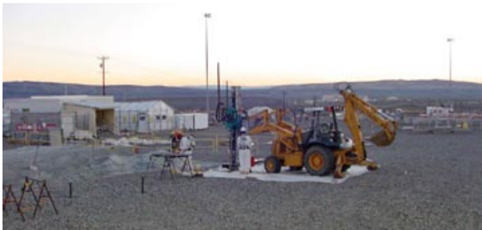
U.S. Department of Energy

PNNL chemists, geologists, hydrologists, and computer modelers conducted a two-tiered investigation of contaminated vadose zone samples collected within the C Tank Farm. Their analyses will help CH2M HILL staff better predict the movement of radioactive and chemical waste plumes from the single-shell tanks through the vadose zone.