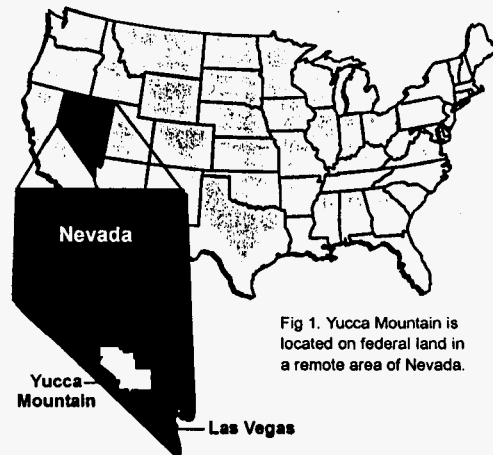
Fig 1. Yucca Mountain is located on federal land in a remote area of Nevada.

Yucca Mountain is located about 160 kilometers (100 miles) northwest of Las Vegas, Nevada, on federal land in a remote, sparsely populated area of the Mojave Desert. A repository at Yucca Mountain would occupy about 600 square kilometers (230 square miles) of land currently under the control of the DOE, the Nevada Test Site, the U.S. Air Force, and the Bureau of Land Management.