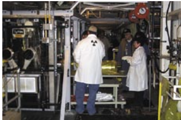
Workers operate the canister cleaning system as part of the Spent Nuclear Fuels Project.