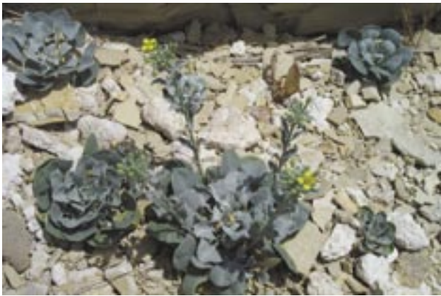
White Bluffs bladderpod is a plant that has been proposed as a candidate for federal listing as a species of concern.

More than 100 rare plant populations of 47 different species are found on the Hanford Site. The U.S. Fish and Wildlife Service has designated 5 of these 47 as species of concern in the Columbia River Basin ecoregion. Two species (Umtanum buckwheat and White Bluffs bladderpod) are proposed as candidates for federal listing.