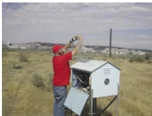
During 2003, personnel collected air samples from a network of continuously operating samplers at 82 locations near Hanford Site facilities.

Air samples collected in 2003 from areas located at or directly adjacent to Hanford Site facilities had higher radionuclide concentrations than did those samples collected farther away. However, radionuclide concentrations in most air samples collected near facilities in 2003 were at or near background levels.