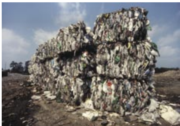
Environmental management involves recycling techniques to minimize the quantity of waste disposed. During 2003, Hanford activities recycled 2,579 tons of sanitary and hazardous waste.

This program focuses on conservation of resources and energy, reduction of hazardous substance use, and prevention or minimization of pollutant releases to all environmental media from all operations and site cleanup activities.