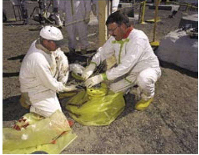
Some Tri-Party Agreement milestones completed in 2003 were related to work on Hanford waste storage tanks.

From 1989 through 2003, a total of 809 agreement milestones were completed and 282 target dates were met. During 2003, 25 change requests to the Agreement were approved. These change requests may be viewed on the Internet at http://www2.hanford.gov/arpir/ .