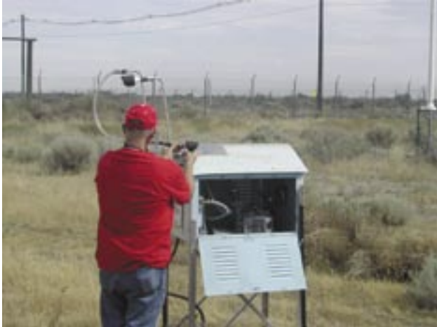
The concentrations of radionuclides in air samples collected on and around the site during 2003 were well below DOE derived concentration guides.

Average tritium concentrations measured in 2003 were slightly higher than average values reported for 1998 through 2002. The highest measured concentration was only 0.074% of the DOE derived concentration guide for tritium.