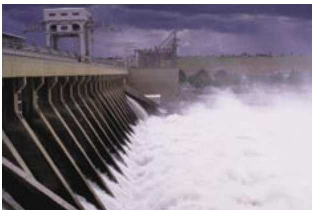
Samples of Columbia River sediment were collected at the McNary Dam pool downstream of the Hanford Site.

Several metals and anions were detected in transect samples collected upstream and downstream of the site. Concentrations were below regulatory limits. Arsenic, antimony, cadmium, lead, nickel, and zinc were detected in most transect samples, with similar levels at most locations. Beryllium, cadmium, chromium, lead, selenium, silver, and thallium were detected occasionally.