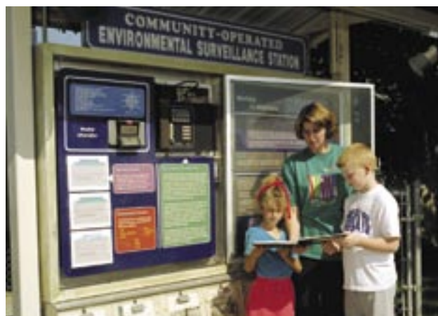
Air samples were collected at four community-operated environmental surveillance stations that were managed by local school teachers.

The annual average gross beta concentration measured in air on the site in 2003 was slightly higher than the average gross beta concentration measured at the distant location and the difference, although small, was statistically significant. Generally, the average gross beta concentrations reported during 2003 were similar to concentrations reported from 1998 through 2002.