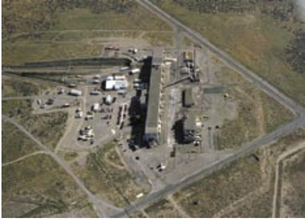
The T Plant Complex operates under RCRA interim status. It provides waste treatment and storage and decontamination services for the Hanford Site.