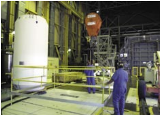
The Fast Flux Test Facility is being deactivated and decommissioned.

The Fast Flux Test Facility, a 400-megawatt thermal, liquid-metal, (sodium)-cooled reactor located in the 400 Area, continued to be deactivated during 2003. Repairs and upgrades to the fuel handling equipment were completed and successfully tested. Following the removal of a hold order imposed by U.S. District Court, sodium was drained from the secondary heat transport system to the Sodium Storage Facility, where it is stored pending future conversion to sodium hydroxide for use by the Waste Treatment Plant. Eighty-one fuel components were washed, packaged, and placed in approved interim storage. This included 32 un-used mixed-oxide fuel assemblies, which are now in the storage at the Plutonium Finishing Plant.