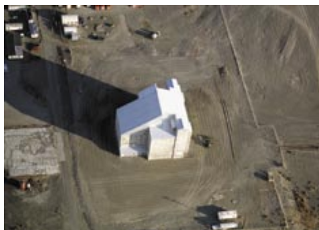
Interim safe storage of decommissioned reactors continued in 2003.