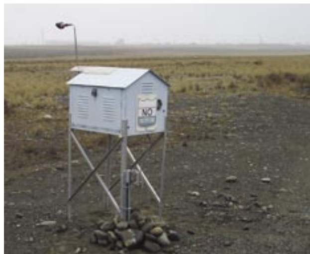
Air samplers on the site were located primarily around major operational areas to maximize the ability to detect radiological contaminants resulting from site operations.

Radioactive airborne emissions from the Hanford Site to the surrounding region are a potential source of human exposure. Most of the radionuclides in emissions at the site are nearing levels indistinguishable from low concentrations in the environment that occur naturally or originated from atmospheric nuclear weapons testing. The termination of nuclear processing operations and the site environmental cleanup mission are largely responsible for this downward trend in radioactive emissions at Hanford.