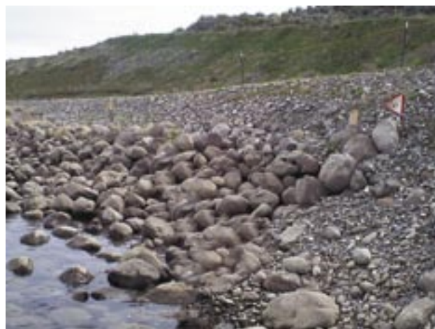
Riverbank spring water was collected from wells near 100-N Area shoreline and analyzed for contamination.

A monitoring well, located near the shoreline, was used to estimate the discharge of radionuclides to the Columbia River at the 100-N Area. This discharge estimate was used to compute the potential radiological doses received by the offsite public and biota in 2003.