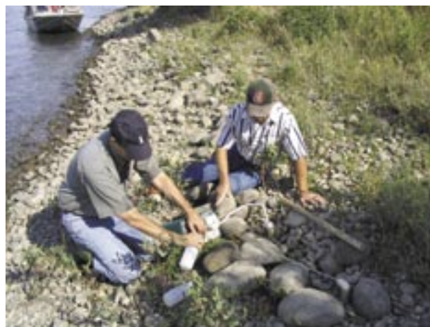
Water samples are collected at aquifer tubes along the Columbia River shoreline

Geiger counters and microrem meters were used quarterly to perform radiological ground-contamination surveys at 13 Columbia River shoreline locations. These measurements were made to estimate radiation exposure levels attributed to sources on the Hanford Site, to estimate levels along the Hanford Reach shoreline, and to help assess exposure to onsite personnel and offsite populations. The surveys showed that radiation levels at the selected locations were comparable to levels observed at the same locations in previous years. The highest dose rate was measured along the 100-N shoreline; the lowest dose rate was measured at the south end of the Vernita Bridge.