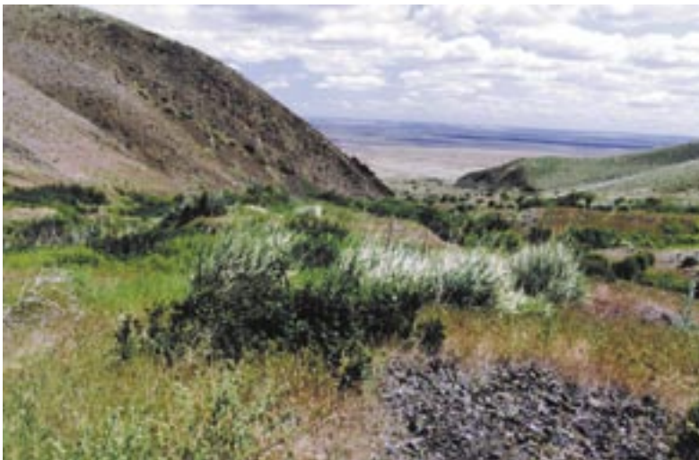
The Hanford Site is a shrub-steppe landscape that contains a rich diversity of plant and animal species.