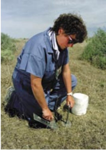
Soil and vegetation samples were collected near waste disposal sites and from locations downwind and near or within the boundaries of operating facilities and remediation sites.