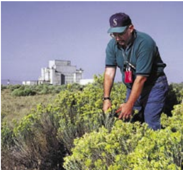
Investigative samples collected in 2003 included soil, vegetation, and animals.

In vegetation samples, cobalt-60, strontium-90, cesium-137, plutonium-239/240, and uranium were detected consistently in 2003. Concentrations of these radionuclides in vegetation were elevated near and within facility boundaries compared to concentrations measured at distant communities. The results demonstrate a high degree of variability.