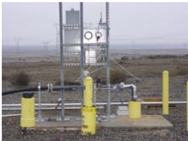
This photo shows a well that is part of a groundwater pump-and-treat system in the 100-K Area. This system reduces chromium contamination in groundwater near the Columbia River.

During 1999, DOE initiated the development of a computer assessment tool that will enable the users to model the movement of contaminants from all waste sites at Hanford through the soil, groundwater, and Columbia River and estimate the impact of contaminants on human health, the ecology, and local cultures and economies. This tool was named the System Assessment Capability and it can be used to examine the risk consequences of cleanup alternatives.