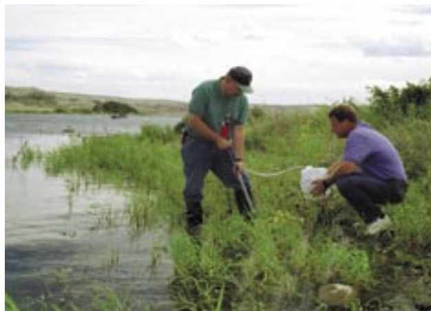
Samples of river water and sediment are collected to determine the impact of Hanford contaminants on surface water bodies.

In 2003, strontium-90 concentrations in Hanford Reach river water for both transect and near-shore samples were similar to concentrations at other locations except for the 100-N Area. Slightly elevated strontium-90 concentrations were detected in some transect samples collected at Benton County near-shore locations at the 100-N Area.