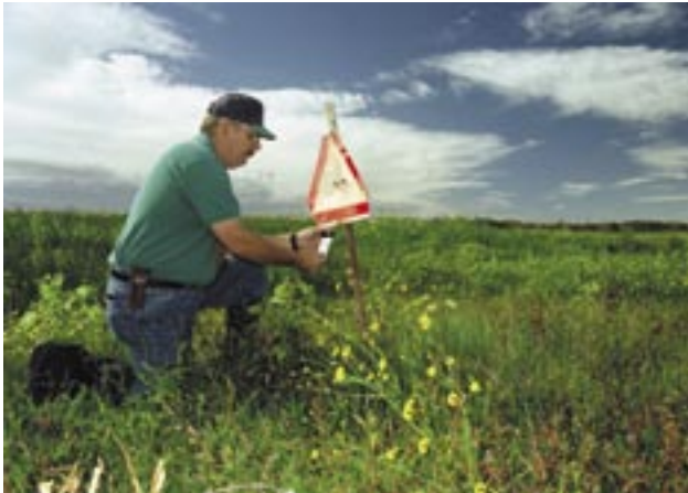
Thermoluminescent dosimeters were positioned 3.3 feet above the ground at 27 locations along the Columbia River shoreline.

Sculpins were collected and analyzed for gamma-emitting radionuclides, strontium-90, and technetium-99 in 2003. None of these contaminants were found in sculpin samples.