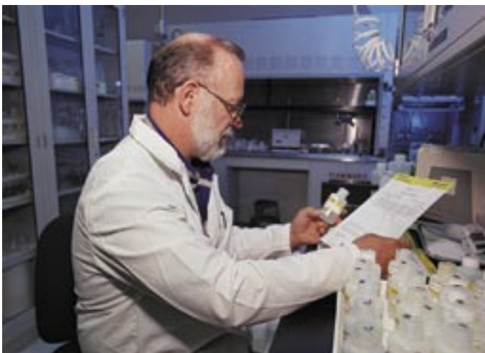
Quality assurance and quality control practices are incorporated into all aspects of site environmental monitoring and surveillance programs.

Quality assurance/quality control for environmental monitoring and surveillance programs also include procedures and protocols to document instrument calibrations; conduct program-specific activities in the field; maintain groundwater wells to assure representative samples were collected; and avoid cross-contamination by using dedicated well sampling pumps.