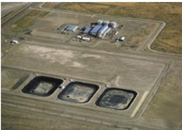
The three basins at the Liquid Effluent Retention Facility are lined with two, flexible, high-density polyethylene membranes.

This facility consists of three RCRA-compliant surface basins that temporarily store liquid waste, including condensate from the 242-A evaporator. The volume of wastewater being stored in the Liquid Effluent Retention Facility at the end of 2003 was 12.3 million gallons.