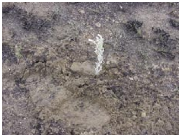
During November 2003, seedlings were planted on the Fitzner/Eberhardt Arid Lands Ecology Reserve.

To compensate for damage to the environment by the original construction at the Environmental Restoration Disposal Facility, a plan was approved by the DOE Richland Operations Office and U.S. Fish and Wildlife Service to re-vegetate land on the Fitzner/Eberhardt Arid Lands Ecology Reserve. The Environmental Restoration Disposal Facility mitigation project includes three separate planting elements: native grass seed and plugs and shrub seedlings. The final portion of this plan was completed in November 2003 when approximately 21,000 4-cubic-inch grass plugs and 20,000 10-cubic-inch shrub seedlings were planted on the Fitzner/Eberhardt Arid Lands Ecology Reserve.