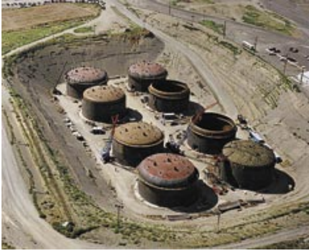
The 177 radioactive waste storage tanks were built at the Hanford Site between 1943 and 1985.

non-radioactive chemicals, and create a solid form of radioactive waste that can be safely disposed. The approach selected to solidify the highly radioactive waste is called vitrification, a process that turns the waste into a stable glass-like material.