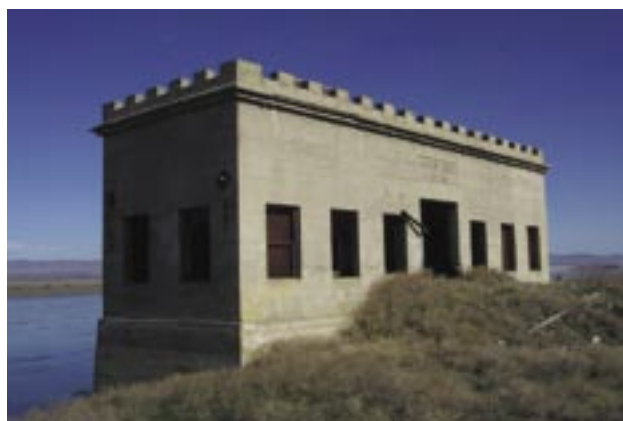
The Coyote Rapids Pumping Plant was built in 1908 and operated until 1943. It is one of the historic buildings being considered for preservation on the Hanford Site.