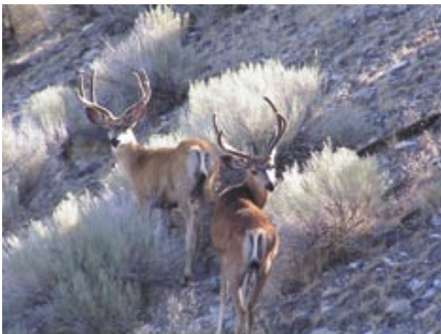
Mule deer are one of the large mammals found on the Hanford Site.

Deer and elk are the major large mammals found on the Hanford Site. A herd of Rocky Mountain elk has inhabited the site since 1972. Coyotes also are plentiful on the site, and waterfowl are numerous along the Columbia River. The Great Basin pocket mouse is the most abundant mammal on the site. Several species of plants, fish, and birds, occurring on the Hanford Site are listed as threatened or endangered under the Endangered Species Act of 1973 .