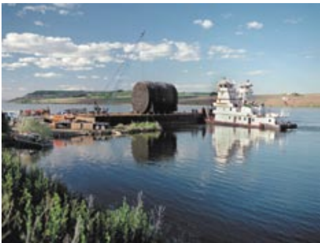
Defueled reactor components from nuclear-powered submarines and cruisers are barged to the Hanford Site and buried in a trench in the 200-East Area.

The Washington State Department of Ecology regulates the disposal of reactor compartments as dangerous waste because lead is used as shielding. The reactor compartments also are managed as mixed waste because of their radioactivity.