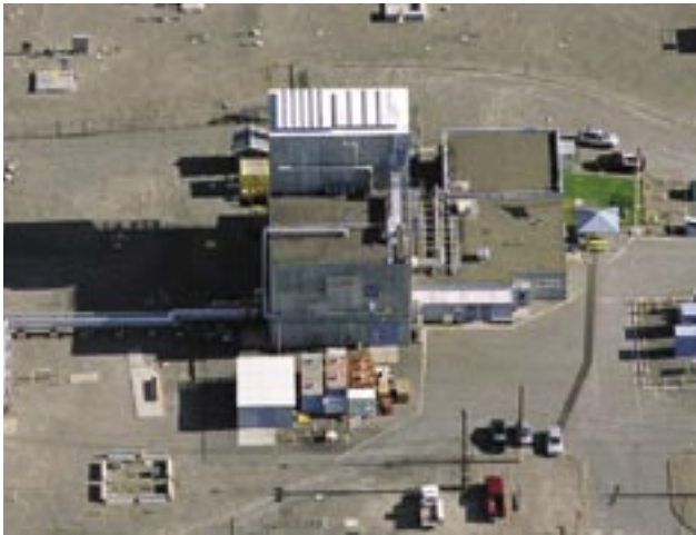
The 242-A evaporator processes dilute liquid tank waste into a concentrate.

Liquid waste is managed in treatment, storage, and disposal facilities to comply with RCRA and state regulations, as briefly described below.