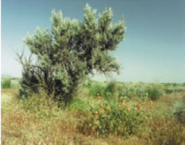
Big Sagebrush communities at Hanford provide habitat for birds and other wildlife.