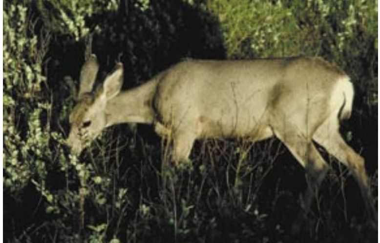
The health of resident mule deer on Hanford has been routinely monitored to assess onsite environmental quality.

Estimates of the frequency of testicular atrophy in antlered deer ranged from 3% to 7% between 1994 and 1997. During 2003, no bucks were seen with signs of testicular atrophy.