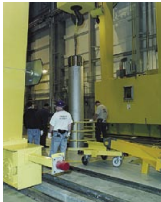
A new multi-canister overpack is lowered into a shipping cask inside the Canister Storage Building.

The goal of this project is to convert the Plutonium Recycle Test Reactor facility, and facilities used for nuclear research, into structures that are in a safe and stable condition suitable for reuse or low cost surveillance and maintenance. During 2003, facility surveillance activities were conducted.