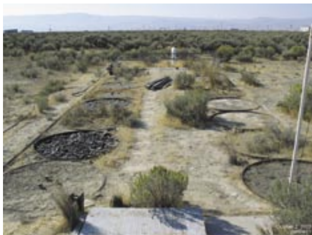
Studies of surface barriers continued in an effort to determine what types of barriers would work best at Hanford waste sites.

Surface barriers form an integral part of DOE's waste management strategy. At the Hanford Site alone an estimated 200 barriers with design lives of 500 to 1,000 years are planned for an area of approximately 1,000 acres. Proven designs, as well as reliable, accurate, and cost-effective monitoring techniques, are needed to ensure post-closure compliance. Studies about surface barriers continued during 2003 in an effort to determine what types of surface barriers would work best at Hanford.