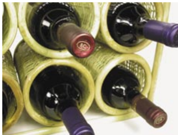
Samples of local red and white wine were analyzed for gamma-emitting radionuclides and none were found in the samples during 2003.