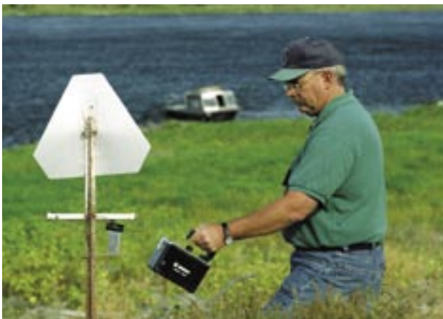
External radiation surveys were conducted quarterly at 13 shoreline locations.