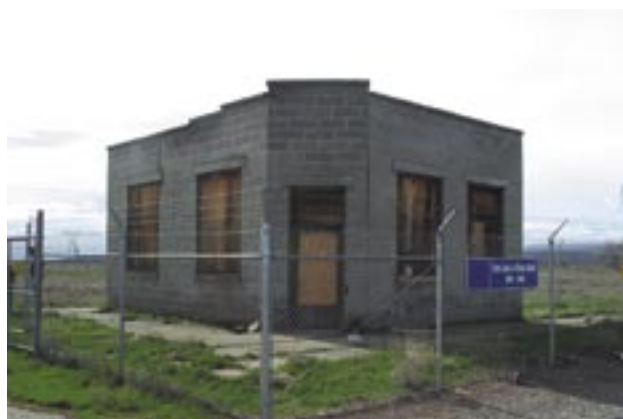
In late 2003, the U.S. Fish and Wildlife Service and DOE conducted emergency stabilization at the First Bank of White Bluffs building. Built in 1907, the bank is the only surviving building from the pre-1943 town site.

Places with cemeteries or known human remains include locations that are sacred to the Wanapum, Yakama Nation, Confederated Tribes of the Umatilla Indian Reservation, and the Nez Perce Tribe. Overall, places with human remains were found to be stable during 2003. No violations were noted.