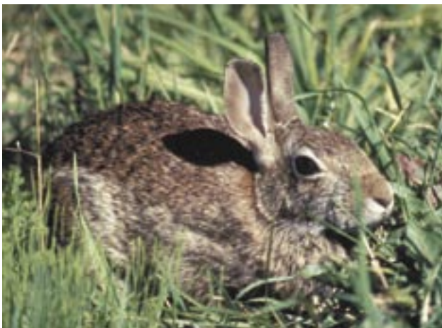
Rabbit samples were collected at 100-N and 200 Areas.

Strontium-90 concentrations in goose bones were all above the analytical detection limit and levels found during 2003 in Hanford Reach and background area samples were similar. The results for 2003 samples were similar to results in 2001 and show an increase in strontium-90 concentrations when compared to values reported from 1995 through 2000. While the apparent increases in 2001 and 2003 are noteworthy, the measured maximum concentrations were below 0.05 pCi/g wet weight and concentrations would need to exceed approximately 60 pCi/g wet weight to be near the DOE dose limit of 0.1 rad per day.