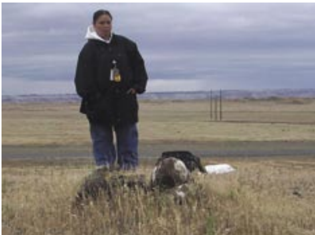
Many areas on the Hanford Site have special significance to tribal members.

These tribes, as well as the Nez Perce Tribe, have treaty fishing rights on portions of the Columbia River. These tribes reserved the right to fish at all usual and accustomed places and the privilege to hunt, gather roots and berries, and pasture horses and cattle on open and unclaimed land. The Wanapum are not a federally recognized tribe, but have historic ties to the Hanford Site as do the Confederated Tribes of the Colville Reservation, whose members are descendants of people who used the area now known as the Hanford Site.