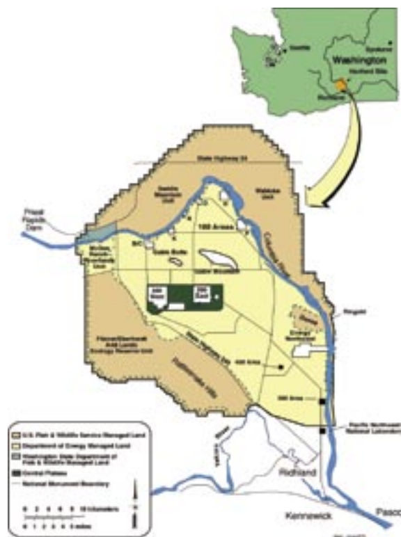
This map shows management units on the Hanford Reach National Monument and the operational areas of the Hanford Site.

Virtually all radioactive and chemical waste generated during Hanford operations, that will remain on the site, will be disposed on the Central Plateau.