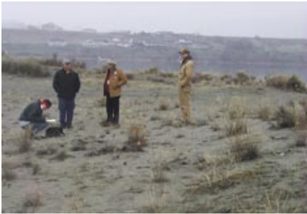
Tribal members work with site contractors during field surveys to identify cultural resource sites.

and the Nez Perce Tribe. The primary purpose of the council is to facilitate the coordination and cooperation of the trustees in their efforts to mitigate the effects to natural resources that result from either hazardous substance releases on the Hanford Site or remediation of those releases. The council met four times in 2003 to discuss issues associated with the cleanup of the Central Plateau and the Columbia River Corridor. Additional information is available at http://www.hanford.gov/boards/nrtc .