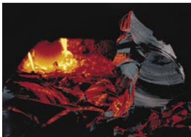
Waste vitrification chemically processes heavy metals and radioactive elements into a durable, leach-resistant glass.

During 2003, three technologies were evaluated as ways to reduce the volume of low-radioactivity waste and accelerate waste processing.