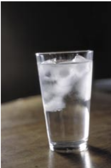
The drinking water on Hanford is tested regularly. During 2003, all drinking water systems complied with Washington State and EPA standards.

All DOE-owned drinking water systems on the Hanford Site were in compliance with Washington State and EPA annual average radiological drinking water standards in 2003, and results were similar to those observed in recent years.