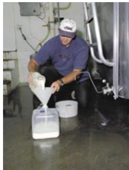
Milk samples were collected around the Hanford Site in 2003 and analyzed for radiological contaminants.

Two samples each of red and white wine were obtained from wineries located downwind of the Hanford Site in Franklin County and upwind of the site in the Yakima Valley. They were analyzed for gamma-emitting radionuclides and tritium. Tritium concentrations in wine samples for 2003 were not available for this report. There were no manmade gamma-emitting radionuclides detected in 2003 wine samples.