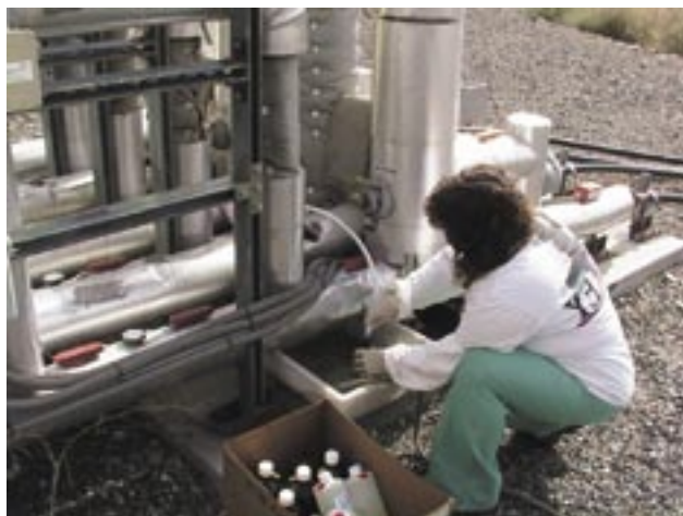
A worker samples an extraction well at the 100-NR-2 pump-and-treat facility.

The total area where contaminants in groundwater plumes exceeded drinking water standards is estimated to be approximately 73 square miles during 2003. This area occupies 12.5% of the total area of the Hanford Site. The tritium and iodine-129 plumes have the largest areas with concentrations exceeding drinking water standards. As expected, most of the maximum contaminant concentrations were detected in the 100 and 200 Areas because these areas contain the largest number of waste sites that have affected groundwater quality.