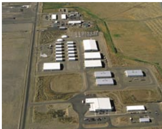
The Central Waste Complex receives waste from Hanford Site cleanup activities and from other DOE and Defense Department facilities.