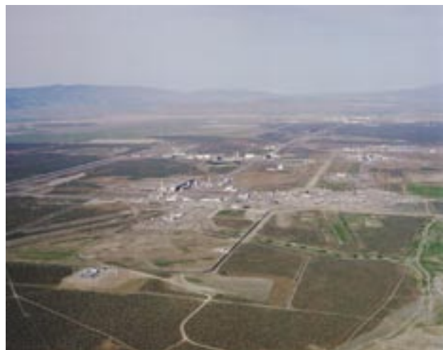
In 2003, 63 radioactive-emissions discharge points were active in the 200 Areas.

Non-radioactive air pollutants were also monitored in 2003. The amounts of pollutants produced by diesel-powered electrical generating plants were calculated from the quantities of fossil fuel consumed. The amount of ammonia discharged to the atmosphere from 200 Area facilities was also calculated (36,000 pounds).