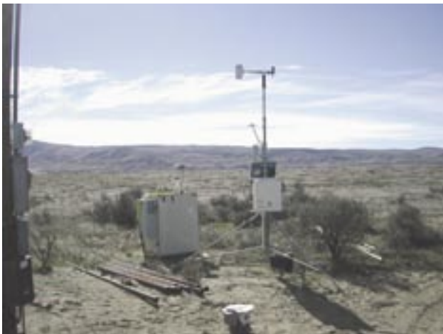
Monitoring air particulates (dust) is done using a tapered element oscillating microbalance (TEOM). The instrument records hourly average concentrations.

Plutonium-238 was detected in three onsite air samples during 2003; the maximum concentration was 8,000 times less than the DOE derived concentration guide for plutonium-238. Plutonium-239/240 was detected in 6 of 40 samples collected onsite and in 1 of 52 samples collected offsite. The maximum concentration was 0.07% of the DOE derived concentration guide for plutonium-239/240.