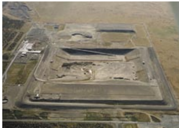
Leachate and soil-gas monitoring continued at the Environmental Restoration Disposal Facility during 2003.

Leachate and soil-gas monitoring continued at the Solid Waste Landfill and the Environmental Restoration Disposal Facility. Also, soil-gas monitoring at the carbon tetrachloride expedited-response-action site continued during 2003.