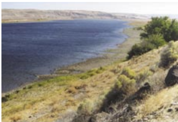
All radiological concentrations in Columbia River water samples collected in 2003 were below regulatory limits and similar to those observed in the past.