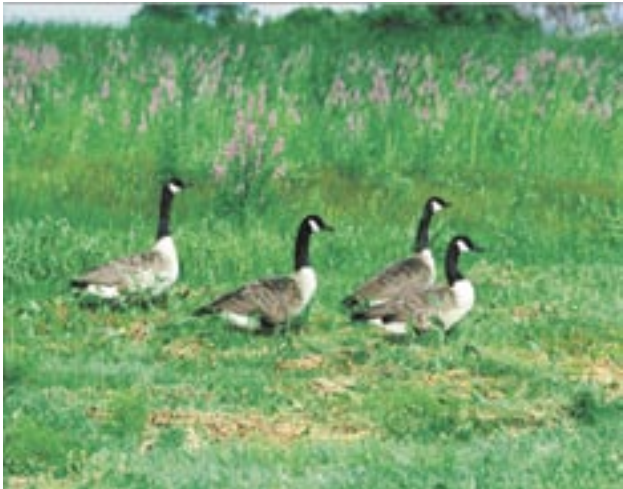
Canada goose samples were tested for radionuclide levels. The results suggest that Canada geese are not accumulating measurable amounts of cesium-137 along the Hanford Reach.

Cesium-137 and strontium-90 results were below their respective analytical detection limits in all fish samples collected and analyzed during 2003.