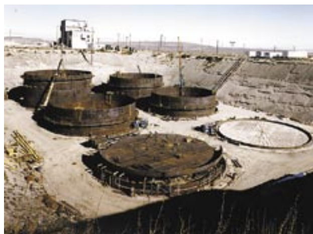
This photograph shows construction of six double-shell tanks built on the Hanford Site. The tanks were later covered with 10 feet of sand and gravel.

In addition to newly generated waste, significant quantities of legacy waste remain.