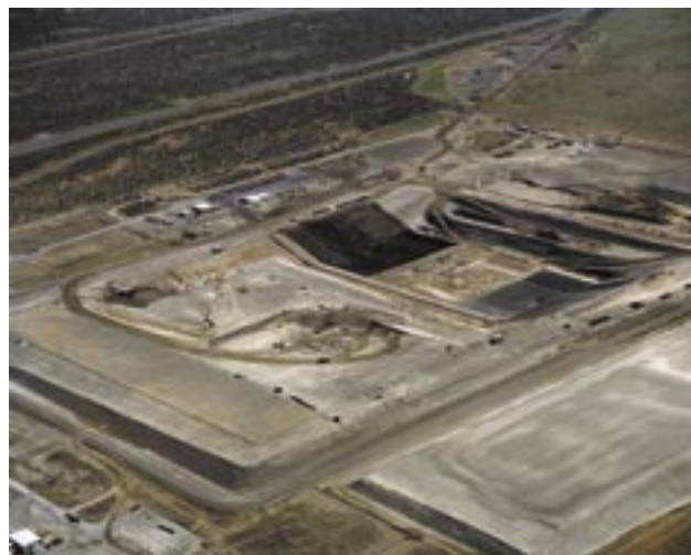
By the end of 2003, the Environmental Restoration Disposal Facility had received 4.6 million tons of contaminated soil and other waste.

Cleanup materials may include soil, rubble, or other solid waste materials contaminated with hazardous, low-radioactivity, or mixed (combined hazardous chemical and radioactive) waste. At the end of 2003, the facility had received over 4.6 million tons of contaminated soil and other waste.