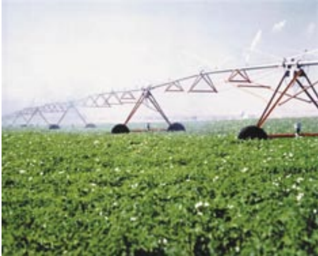
Irrigation water was tested three times in 2003. Radionuclide concentrations were below DOE derived concentration guides and Washington State water quality criteria levels.