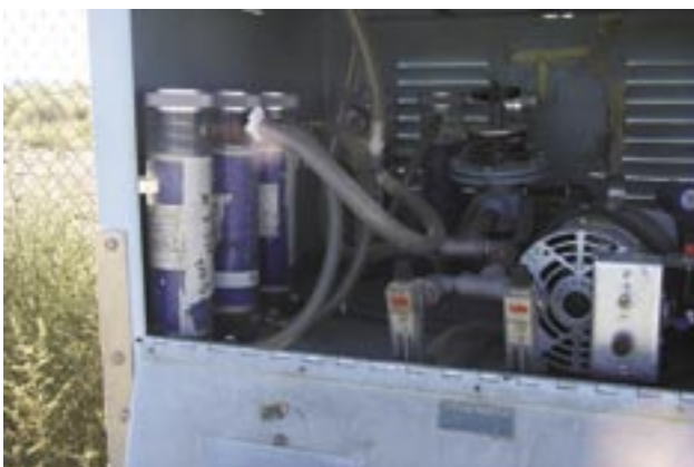
Continuous monitoring of radioactive emissions involves analyzing samples collected near points of discharge to the environment.

The 300 Area primarily has laboratories and research facilities. The main sources of airborne radionuclide emissions were the 324 Waste Technology Engineering Laboratory, 325 Applied Chemistry Laboratory, 327 Post-Irradiation Laboratory, and 340 Vault and Tanks. During 2003, there were 22 radioactive emission discharge points in the 300 Area.