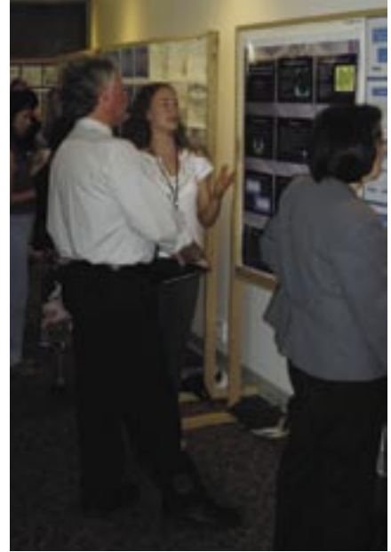
Public meetings help keep citizens informed about Hanford decisions.

The board held six 2-day meetings during 2003 and issued 12 pieces of consensus advice. Information about the Hanford Advisory Board, including copies of its advice and responses can be found on the Internet at http://www.hanford.gov/boards/hab/index.htm .