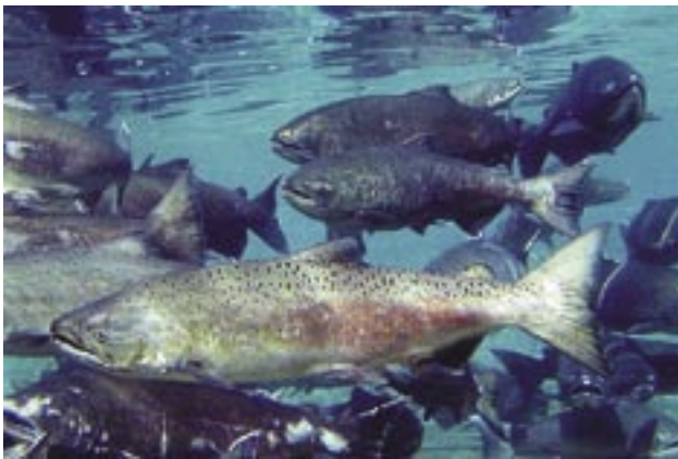
There were 9,400 Chinook salmon spawning nests (redds) observed during aerial surveys of the Hanford Reach during 2003. This is an increase over 2002 numbers and surpasses the peak number counted in 1989.

Ecosystem monitoring at Hanford is conducted to assess the status of plant and animal populations on the Hanford Site, maintain biotic inventory data for the site, and assist in implementing ecosystem management policies. The status of rare plant populations and plant community types, Chinook salmon, mule deer, and breeding birds were monitored as part of the project.