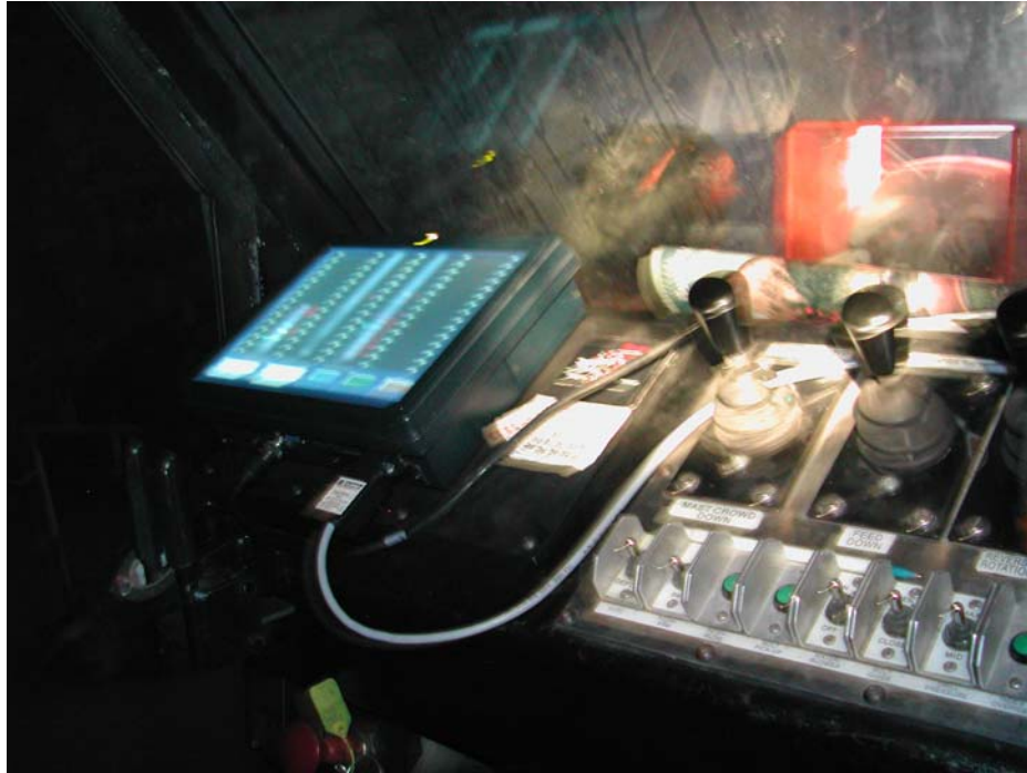
Fig. 2 Testing of the Special Version of MRGIS Program in an Underground Limestone Mine