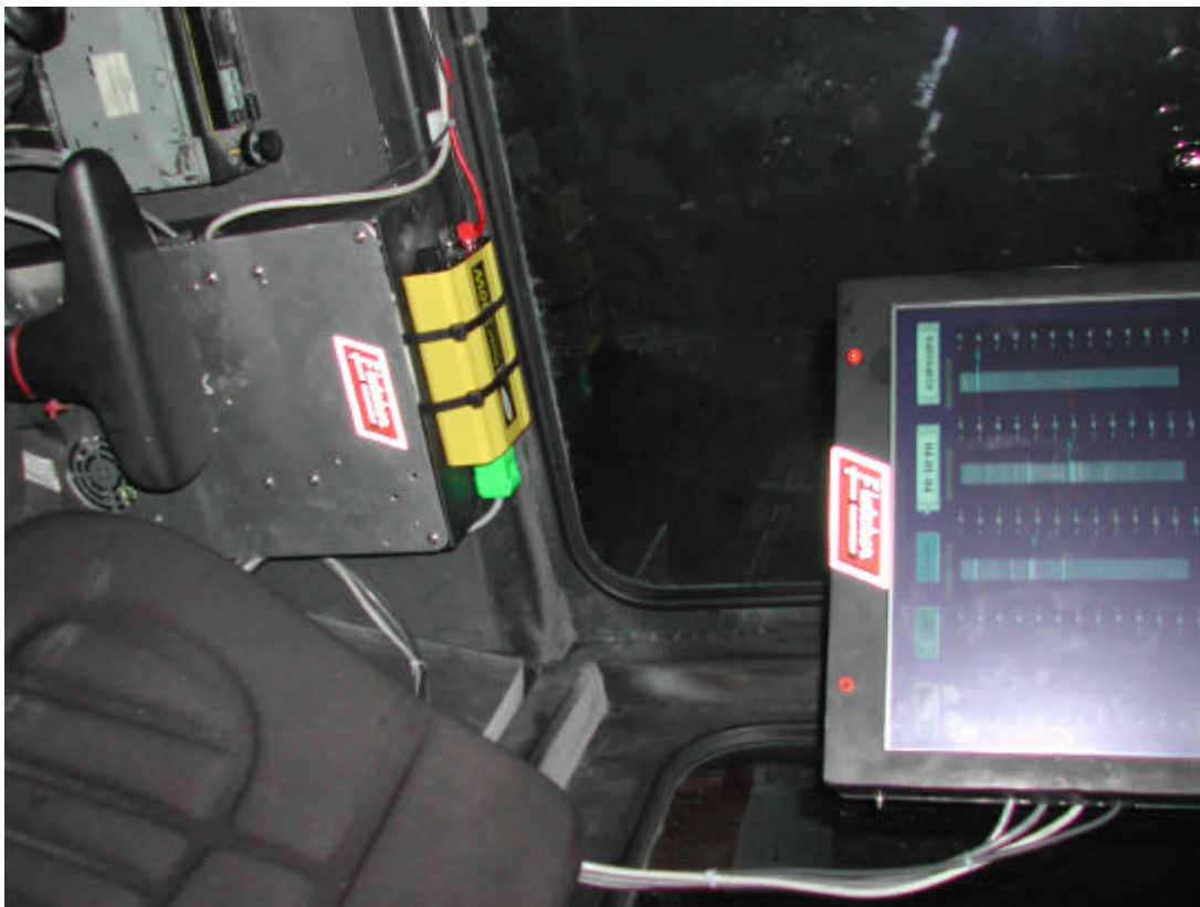
Fig. 1 Testing of the Special Version of MRGIS Program in an Underground Limestone Mine

The commercialization of the research results is also under way. A special version of the geology mapping program for roof bolters in limestone mine has been developed with the sponsorship of the J.H. Fletcher, Co. and currently is in the testing stage. The following photo shows the special version of the program in testing site in an underground limestone mine.