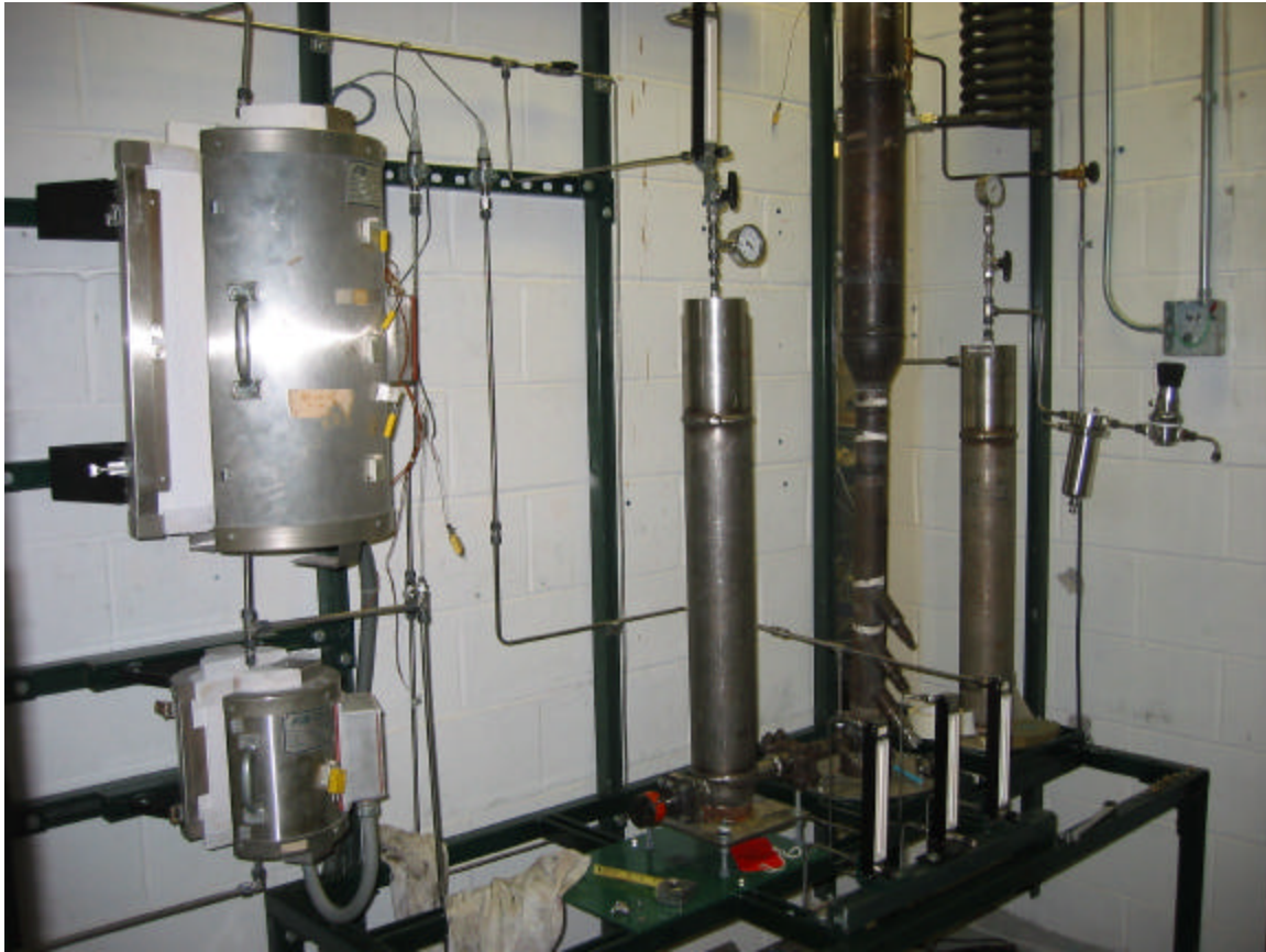
Figure 2. Mini-Bench Gasification Hardware

On August 29 th , GTI conducted a status review meeting with Calla Energy and visited the project site in Irvine, Ky. GTI collected biomass samples to be tested in the mini-bench unit from two saw-mills located within 3 miles of the site.