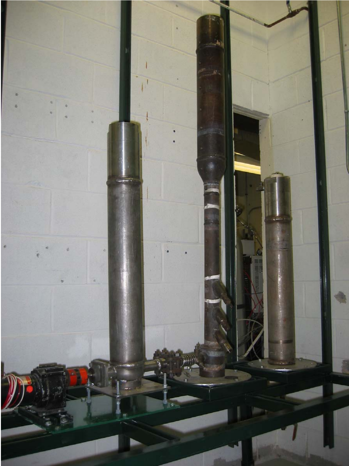
Figure 2. Mini-Bench Gasification Hardware