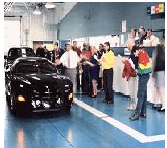
Lane at an Adesa Auction