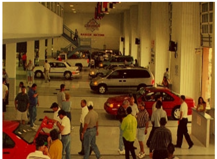
Figure 2 - Lanes at a Manheim Auto Auction

George E. Hoffer, an economist at Virginia Commonwealth University who specializes in automotive retailing, observes that used car auctions are very cost efficient, with auction fees typically amounting to just a few