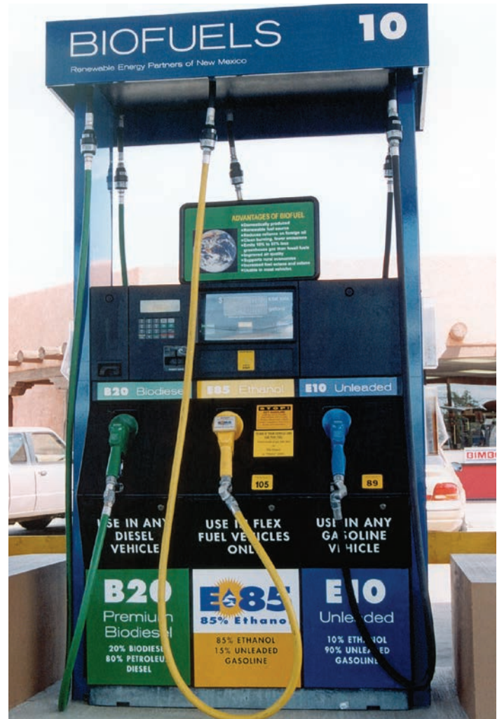
Photo from Charles Bensinger and Renewable Energy Partners of New Mexico, NREL 13531