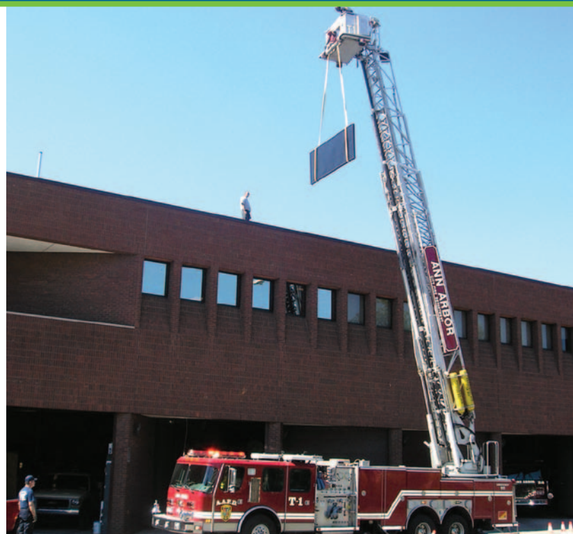
Fire Station #1 in downtown Ann Arbor became the first fire station in Michigan to use solar hot water in 2007.