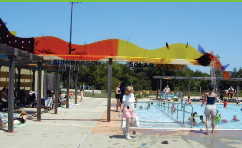
The Fuller Pool Sun Dragon helps to draw attention to one of Ann Arbor's solar pool heating systems.