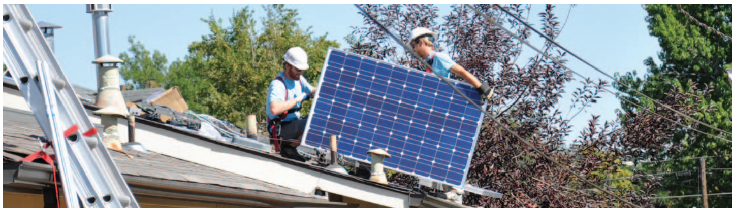
Figure 4. Trainees installing PV systems.

Two trainees were selected to work on the PV system installations. They assisted with panel and rack assembly and installation, wiring, and other job-site duties. Because of project installation delays, two additional trainees worked on job sites with another solar installation company prior to the NDHC solar installation; both were hired as solar salesmen for that company. Figure 4 shows a photo of the trainees installing PV systems.