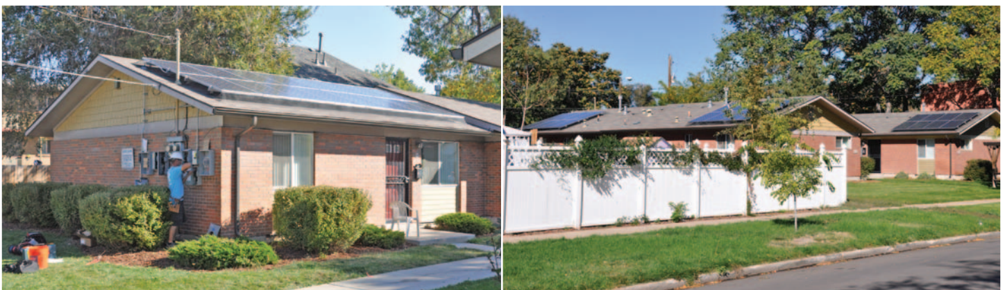
Figure 1. Single-story duplex PV systems.

A grant from the state of Colorado's Governor's Energy Office for $107,500 was awarded to NDHC to finance the PV systems. The grant was then invested into the project in the form of a loan from NDHC to the investor, which combined the loan with the Xcel rebate, its own equity, and the federal tax incentives to pay for the installation of the PV systems.