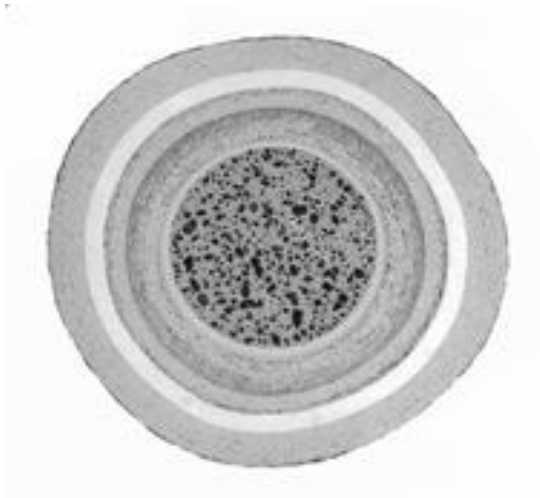
TRISO-Coated Particle with Mixed Pu, Th Oxide Kernel after High Pu Burnup