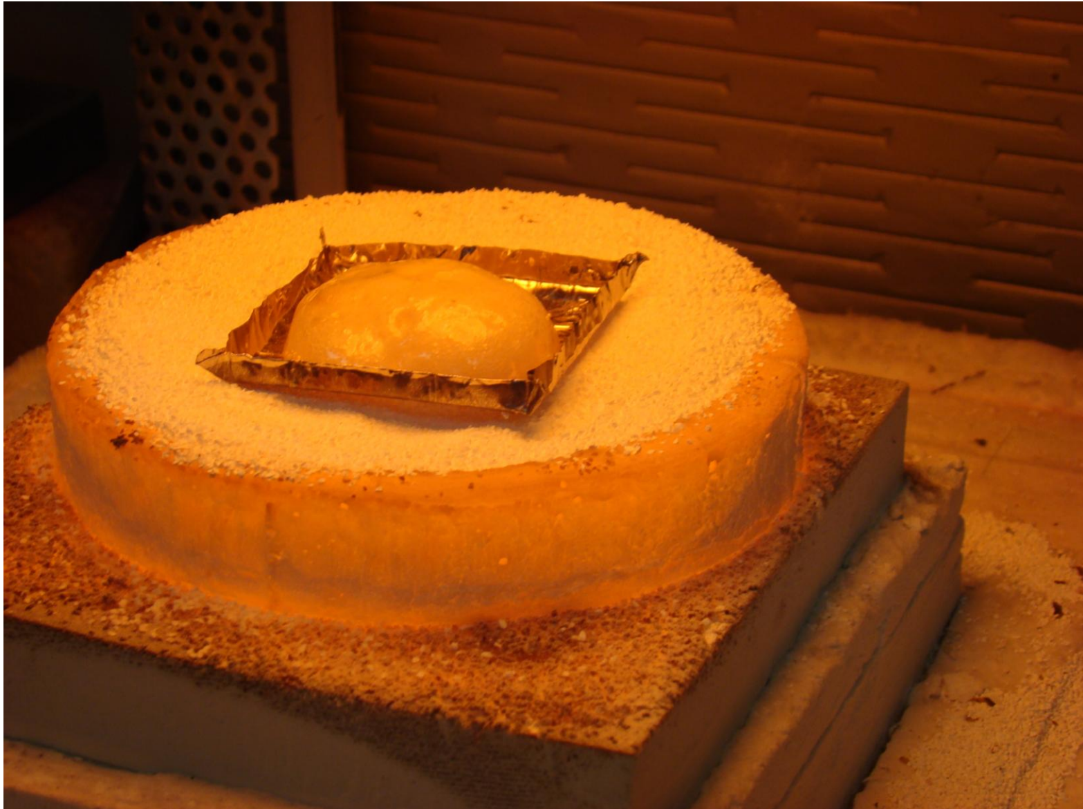
Figure 3. Image of swarf foaming in the furnace.