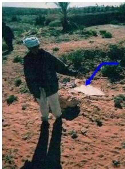
Fig. 6 A well of a foggara in the oasis of Lahmar

The vocation agro pastoral oasis Lahmar is located 30 km from the town of Bechar. The existence of permanent water points allows the oasis to have self-sufficiency in agriculture. The sources of water are drained by 4 foggaras which are located in the northern part of „ksar“. These are Aine Djemal, Omran, Tawrirt and Lahmar. The Tawrirt foggara, the largest of them, includes 18 wells to a maximum depth of 25 metres. The smallest one, Omran, includes 4 wells, 6 metres in depth (Fig. 6). At the end of foggaras, the water is stored in the collective “madjens” (Fig. 7). At the end of “madjens”, each owner receives its share of water through „seguias“. The irrigation of gardens goes in turn. In the oasis of Lahmar, there are 24 families and their descendants who are affected by these water rights. The unit of measurement used in the oasis of Lahmar is “tanast” which corresponds to 45 minutes. Because of the contribution of modern techniques and inheritance issues, the foggaras have been abandoned.