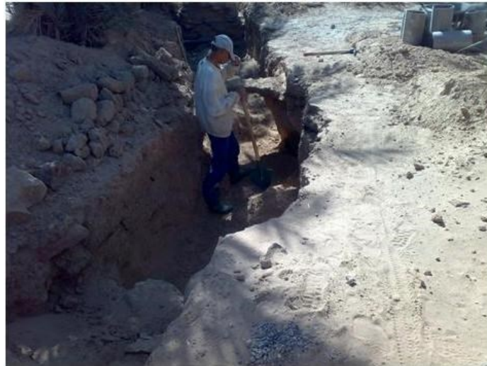
Fig. 5 Rehabilitation of „seguias“ in the oasis of Beni Ounif