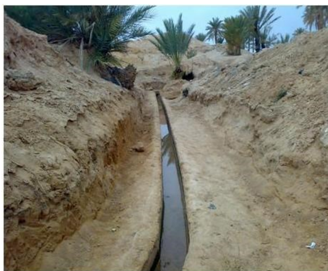
Fig. 4 Seguia in the oasis of Beni Ounif