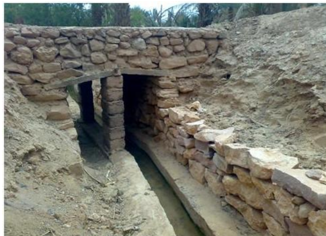
Fig. 3 Output of a foggara of the oasis of Beni Ounif