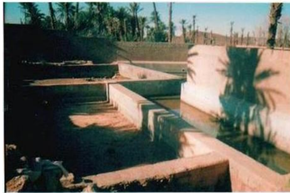
Fig.7 A “madjen” in the oasis of Lahmar