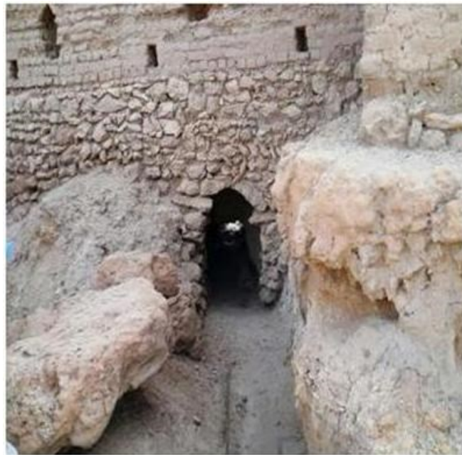
Fig. 2 Output of a foggara below the „ksar“of Ouakda