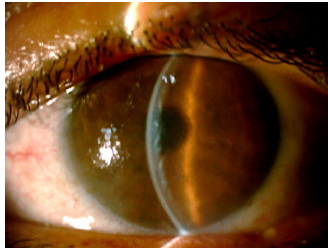
Figure 2. Slit cut under double illumination that allows to observe thickening, opacity and folds of Descemet's membrane.

The causes of acute corneal edema can be divided into three large categories (10): triggered by epithelial or stromal noxas, such as trauma or viral infection (11-13); triggered by endothelial dysfunction, as will be discussed throughout this article; and triggered by elevation of intraocular pressure (IOP) (2).