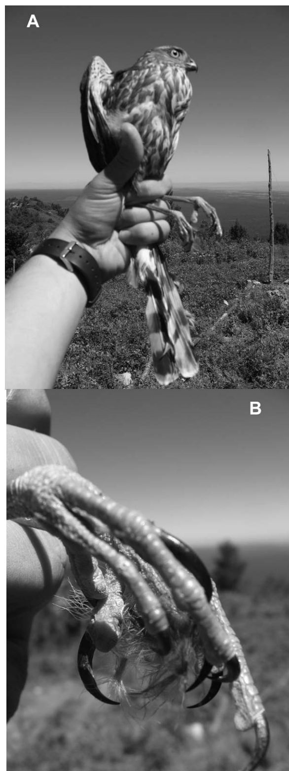
FIGURE 1. (A) A hatch-year Sharp-shinned Hawk captured at Capilla Peak in the Manzano Mountains, New Mexico, with distended crop, indicating recent prey capture and consumption. (B) Close-up of feet of the same bird, showing feathers of prey stuck to toes and talons.

Other researchers sampled potential avian prey in the area at two sites, one near the raptor-banding site at Capilla Peak (DeLong et al. 2005) and the other 35 km north of Capilla Peak in the foothills of the Manzanita Mountains near Coyote Springs. The mist-netting site at Capilla Peak was ~1 km from the primary raptor-banding site along the same ridge complex used by migrating raptors. Migrating raptors frequently passed through the netting area, hunted in the vicinity, and were occasionally captured in the mist nets. The Coyote Springs mist-netting site was in the same mountain range as Capilla Peak, with raptors known to pass through the area before arriving at Capilla Peak. Thus prey sampled